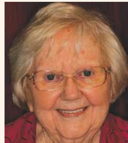
After, with Oxford Temp in place.

appearance of natural stain. Use a small amount, as this can be intense.