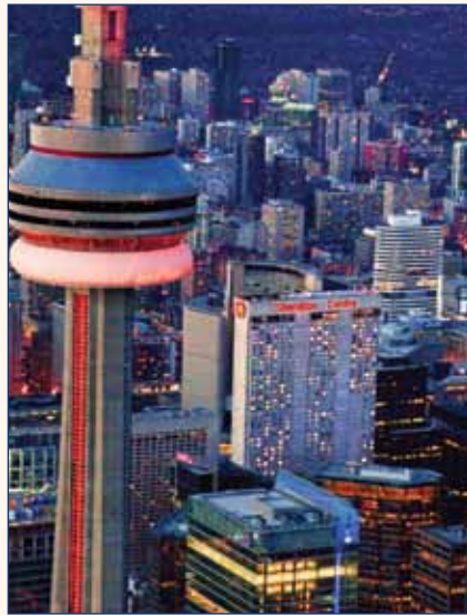
The single-day Toronto Academy of Dentistry Winter Clinic, Friday, Nov. 14, has a new home: Toronto Sheraton Centre.