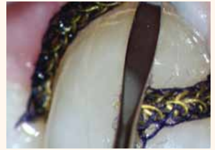
Working with a microscopic view.