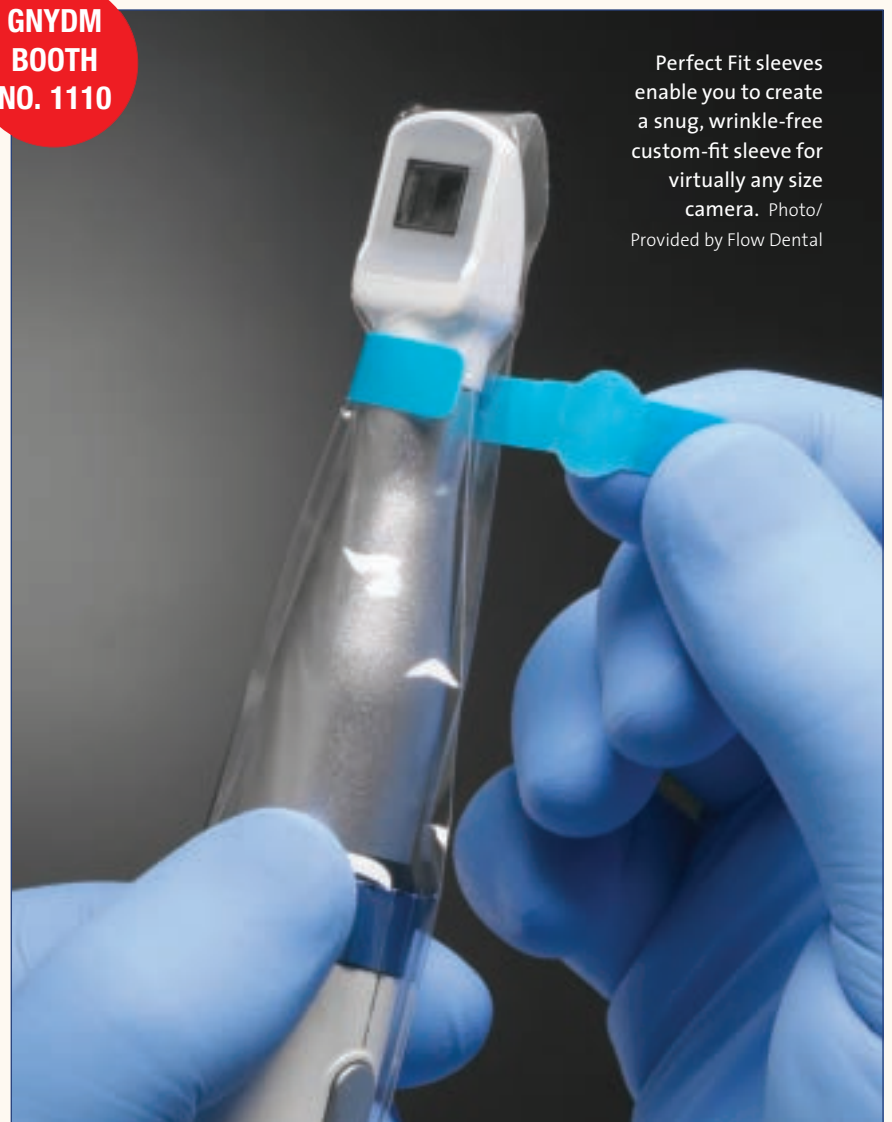
Perfect Fit sleeves enable you to create a snug, wrinkle-free custom-fit sleeve for virtually any size camera.