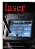
Cover image courtesy of Fotona, www.fotona.com