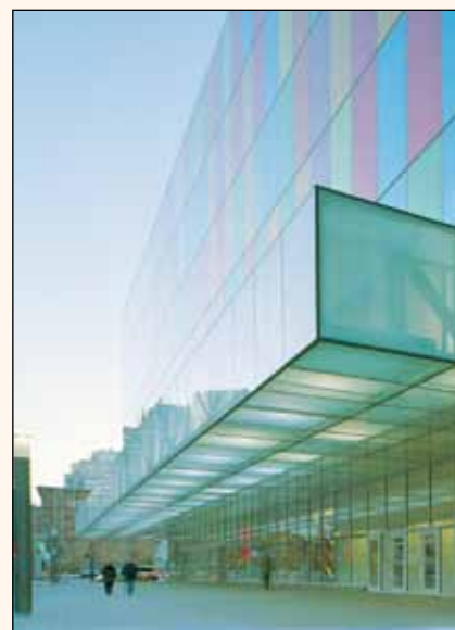
JDIQ is May 22-26 at the Montréal Convention Centre (Palais des congrès de Montréal).