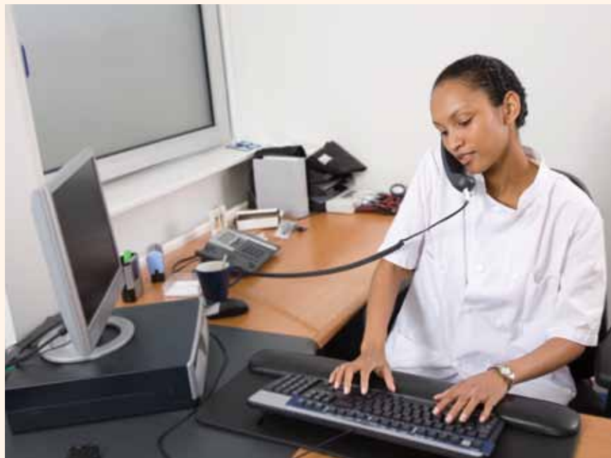
If an employee has the title of office manager, but not the responsibility or any decision-making authority, he or she will eventually 'check out' emotionally from the position and then physically from the practice.