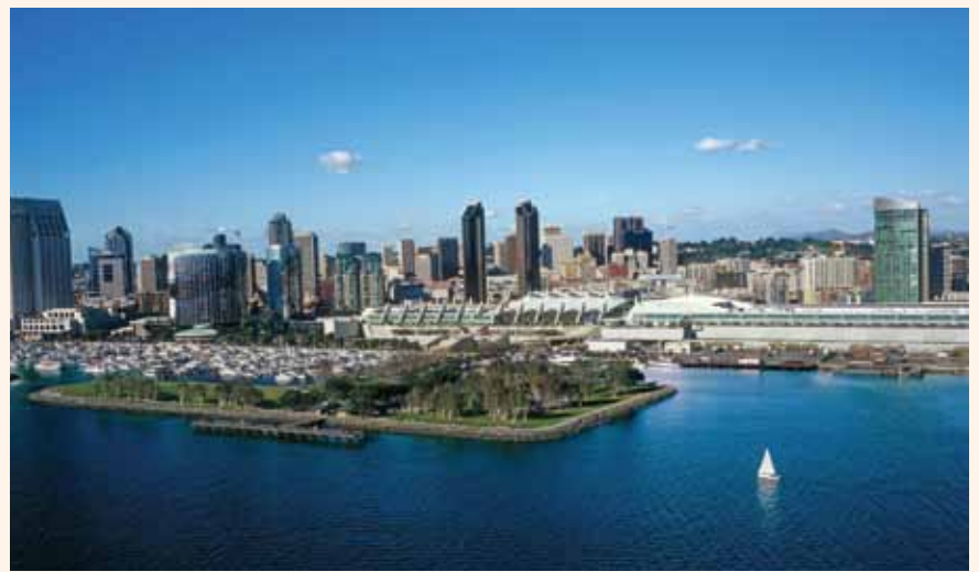
The San Diego skyline and so much more awaits those who are heading to the Academy of General Dentistry Annual Meeting July 27-31.