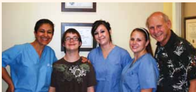
A new clinic in California will serve needs of developmentally disabled patients.