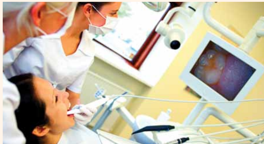
'Patient retention is where practice profitability is best achieved.'

Next, minimize those aspects of the dental visit that patients dislike