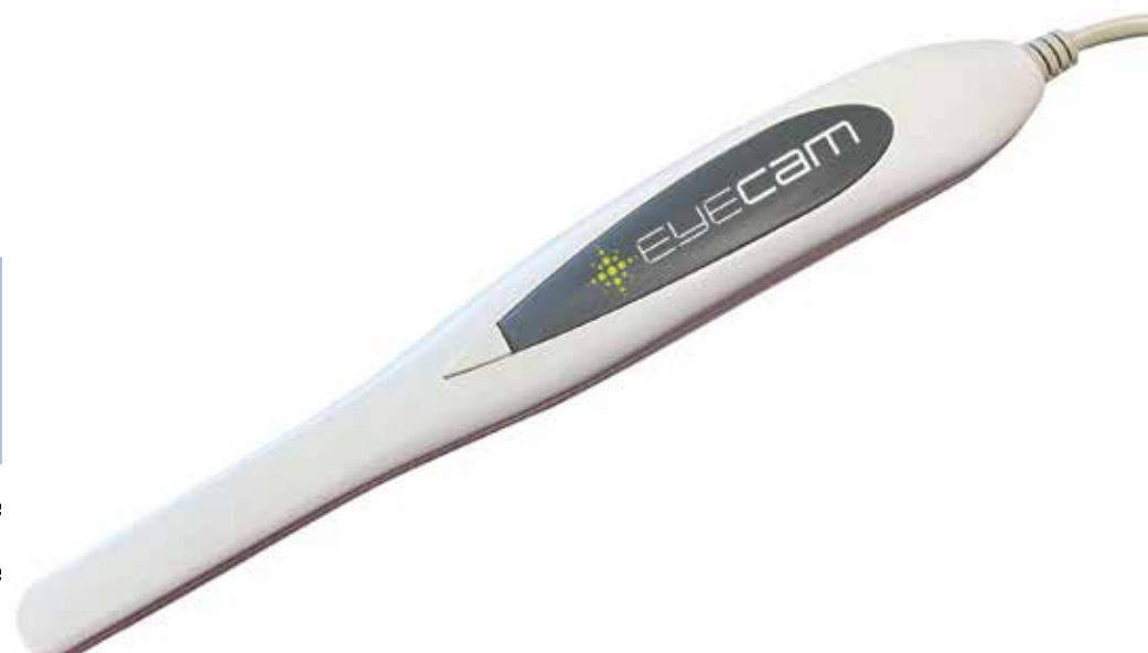
• The new EyeCam.

More information will be available at Shofu's booth, No. 1128.