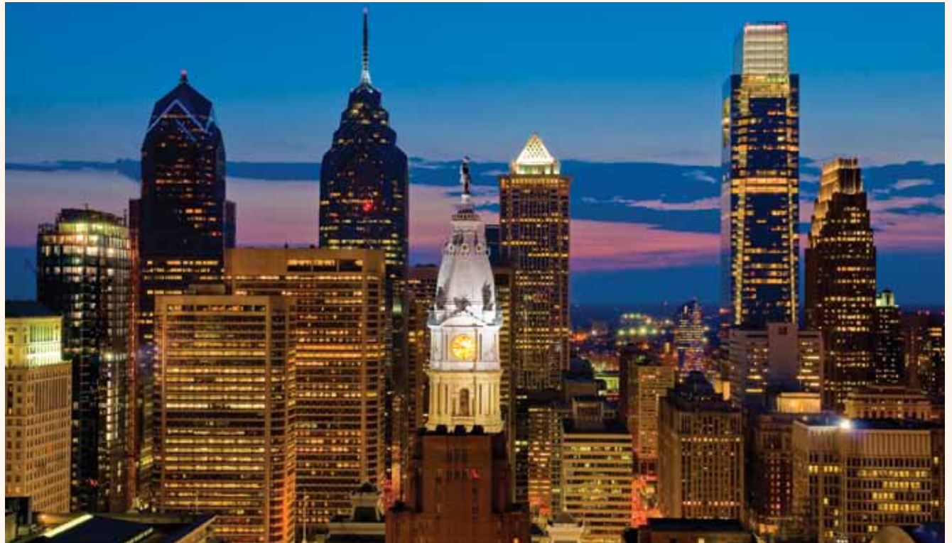
An evening sky view of Philadelphia highlights the contrast of new and old standing side by side. In the photo's center is the bronze statue of the city's founder, William Penn, sitting on top of the 511-foot-tall City Hall Tower with its lighted clock. The newest addition to the skyline, the Comcast Center on the right, is the tallest building between New York and Chicago.

Exhibit hall hours are 4:30 to 7:30 p.m. Thursday, June 21, with an all-attendee welcome reception from 5:30 to 6:30 p.m. The next day, Friday, June 22, the exhibit hall opens at 10 a.m. and closes at 6:30