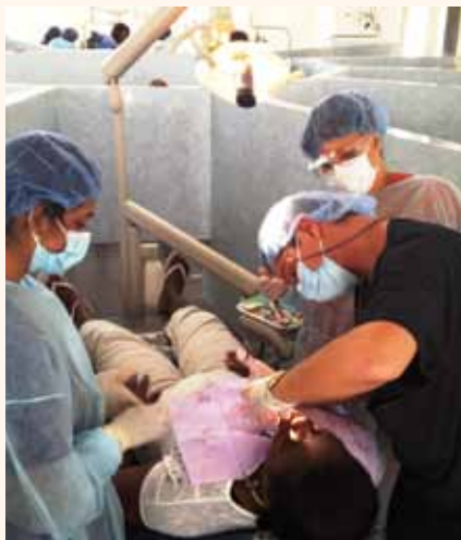
The AAIP/ADIS course is tax deductible and worth 35 hours of dental continuing education credits.

(Source: The American Academy of Implant Prosthodontics)