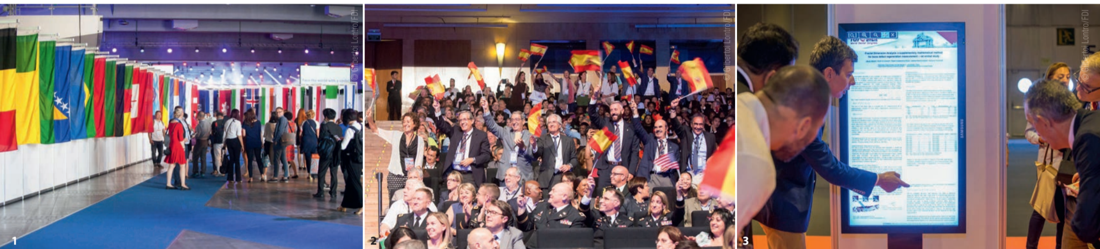
Fig 1: FDI is one of the oldest dental organisations and its membership comprises about 200 national dental associations and specialist groups in over 130 countries. Fig 2: The internationality of the event is drawn home when FDI member countries display their countries' flags during the rousing flag ceremony, which is part of each congress opening. Fig 3: Presentations and posters submitted and reviewed by an expert panel ahead of the congress will be on display in Sydney.

| World Dental Congress makes triumphant return to an in-person event in Sydney