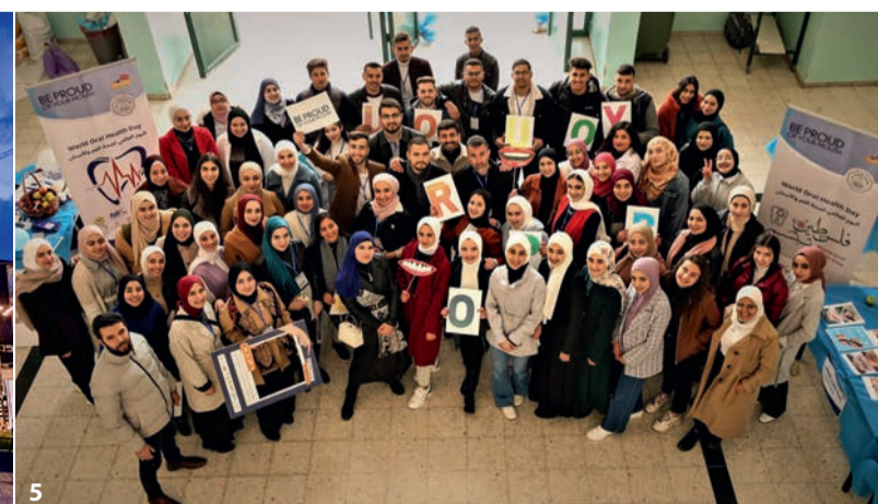
Fig 3: Award winners 2022: WOHD award winners 2022. Fig 4: In 2022, the Hellenic Dental Association projected the WOHD logo on several buildings. Fig 5: The Palestinian Association of Dental Students made a huge impact on Facebook, Instagram and Twitter in 2022. They shared photos and stories of their WOHD activities with their WOHD reel on Instagram gaining nearly 5,000 views.