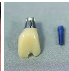
Fig. 12: The screw-retained crown as a finished polished temporary.