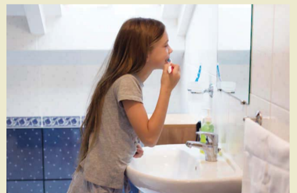
In a recent study, researchers in Germany have found, since a previous 2003-2006 report, the frequency of dental check-ups has increased.

BERLIN, GERMANY - In a new study, researchers from the Robert Koch Institut (RKI) have examined, among other subjects, the prevalence, determinants and trends of tooth brushing frequency and utilisation of dental check-ups in children and adolescents in Germany. The reports are based on