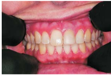
Fig. 2: Single-tooth exposure of tooth #21 after recurrent marginal gingivitis. Owing to the initial diagnosis of extensive resorption, the tooth could not be preserved.