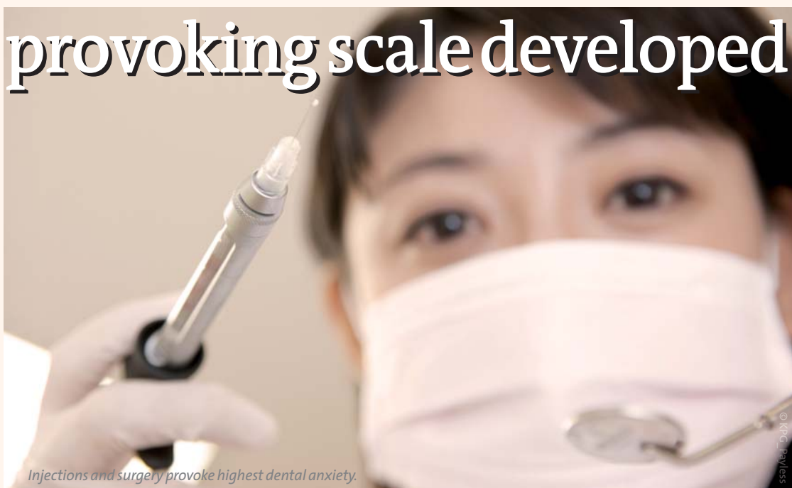
Injections and surgery provoke highest dental anxiety.

In a sub-group of 160 participants, injections and surgical treatment, in particular, were identified as