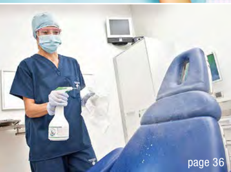
Cover image courtesy of miscea GmbH www.miscea.com