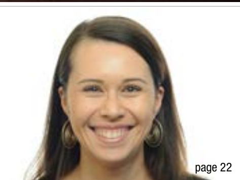
Cover image