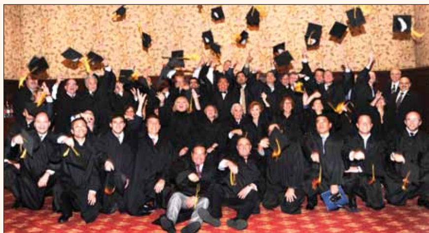
Like this group earning IADFE fellowships in 2013, a new group will wear gowns and toss caps in December in New York City.