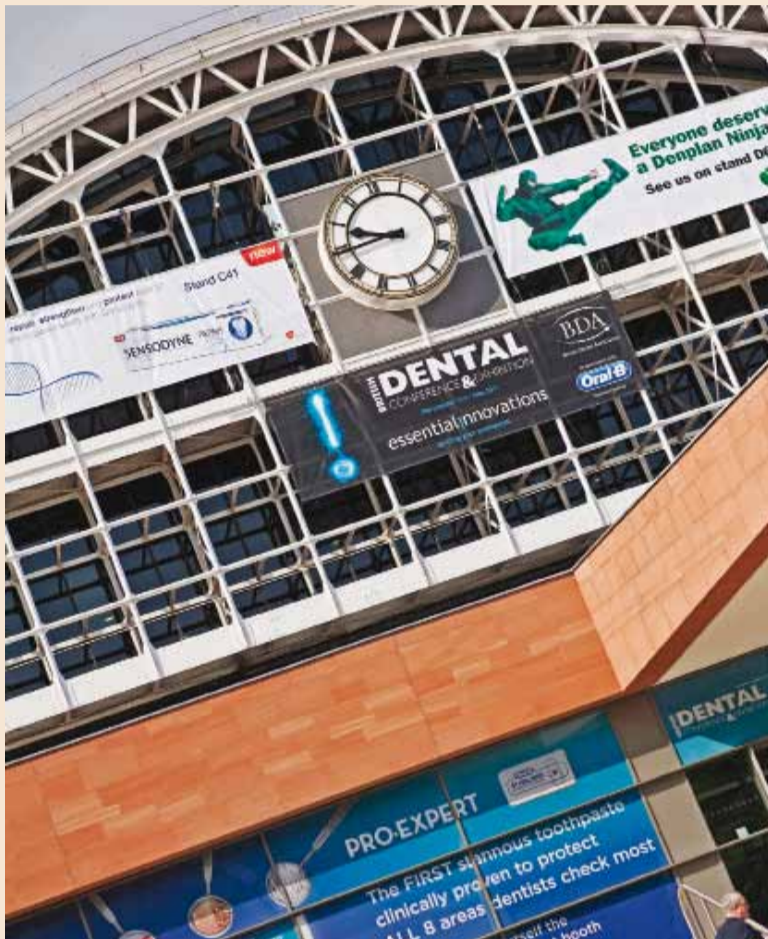
Outside the Manchester Central Convention Complex

Dental Tribune previews this year's Manchester event