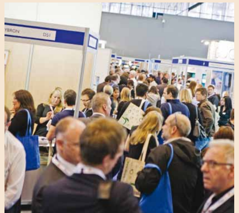
Delegates at the British Dental Conference and Exhibition

On Thursday the entertainment begins at 18:00 at the Central Hall with the exhibition hall drinks reception as the BDA hosts a get together to celebrate the opening day of the event!