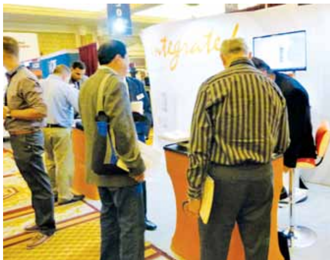
• Attendees lined up at the Implant Direct booth, No. 414, to check out new products like the Legacy 4 Implant.