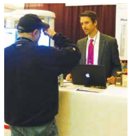
• Stop by the Planmeca booth, No. 203.