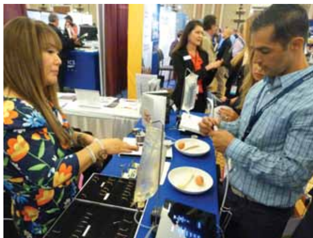
• An AAID attendee checks out Piezosurgery technology at booth No. 510.