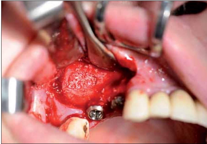
Fig. 13: After the insertion of the dental implant, loose filling with augmentation of the lateral side takes place.