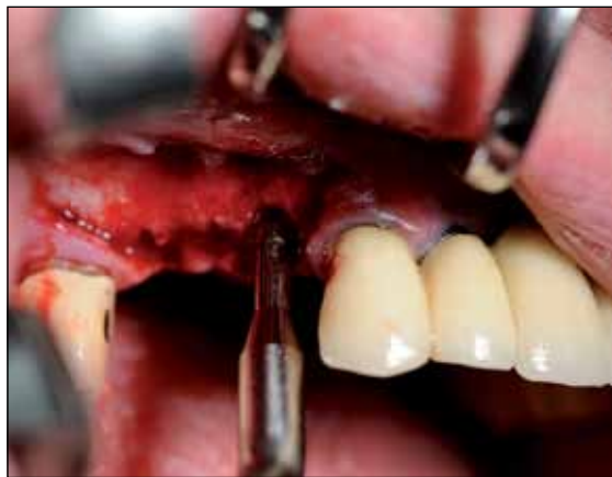
Fig. 9: Preparation of the implant cavity after pilot hole with bone-condensing instruments.

‘Clinicians should always be open to learning new methods, but must do so with the responsibility to their patients in mind.’