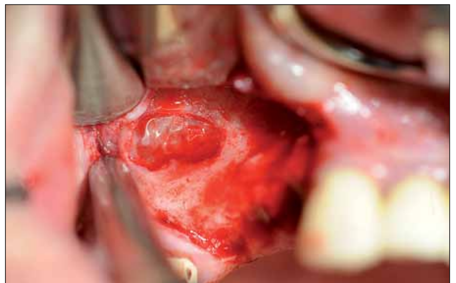
Fig. 6: Illustration of the intact Schneiderian membrane in region #16.