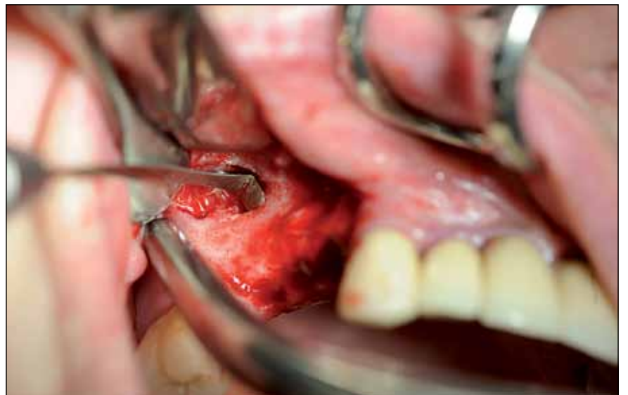
Fig. 8: Lifting and moving of the Schneiderian membrane.