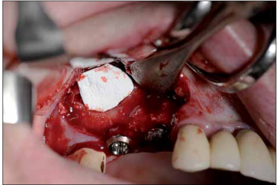
Fig. 14: Coverage of the facial bone defects with residual Bio-Gide membrane.