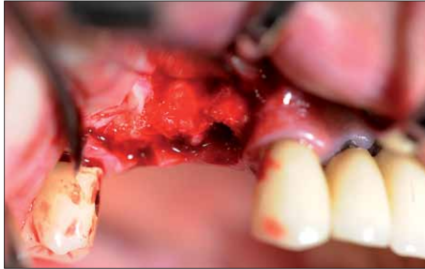
Fig. 2: Surgical site after surgical flap preparation shows fully ossified alveolus of tooth #14, six weeks after extraction.

Today, it is common knowledge that the long-term success of dental implants depends on the degree of osseointegration. This, in turn, is dependent on the primary stability, on the one hand, which is determined by the density of cortical bone and the bone quality, and on