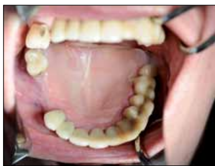
Fig. 1: Pre-operation, vestibule area is relatively broad, flat ridge regions #14 to #16, six weeks after extraction of tooth #14.