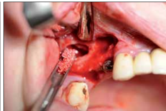
Fig. 11: After stabilization of the Schneiderian membrane, the Bio-Gide membrane is raised by the introduction of Bio-Oss granules (Geistlich), blood from the operation area and mixed with autologous bone chips of the patient.