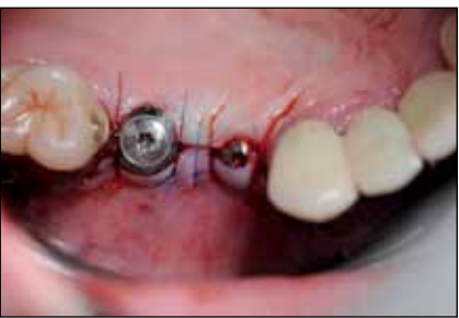
Fig. 16: X-ray after external sinus lift shows no displacement of the augmentation material in the maxillary sinus.