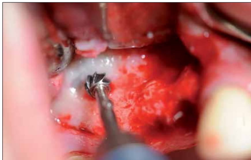
Fig. 3: Pre-preparation of the bone window in region #16 with large Rosecutter to mark the finish line under continuous cooling.