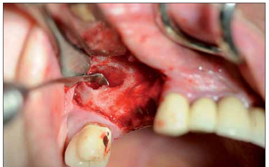
Fig. 7: Carefully solution of the Schneiderian membrane from lateral to caudal.