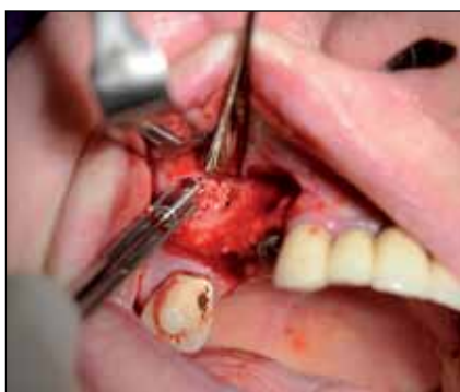
Fig. 12: Another gentle introduction of the augmentation in the Bio-Gide membrane before insertion of the dental implant in region #16.