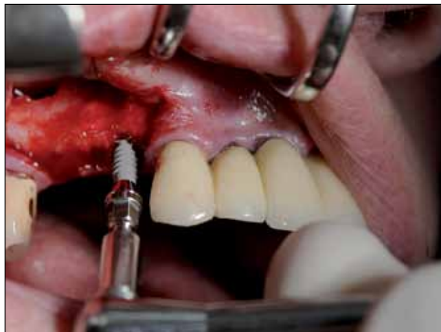
Fig. 10: Insertion of the implant in region #14.