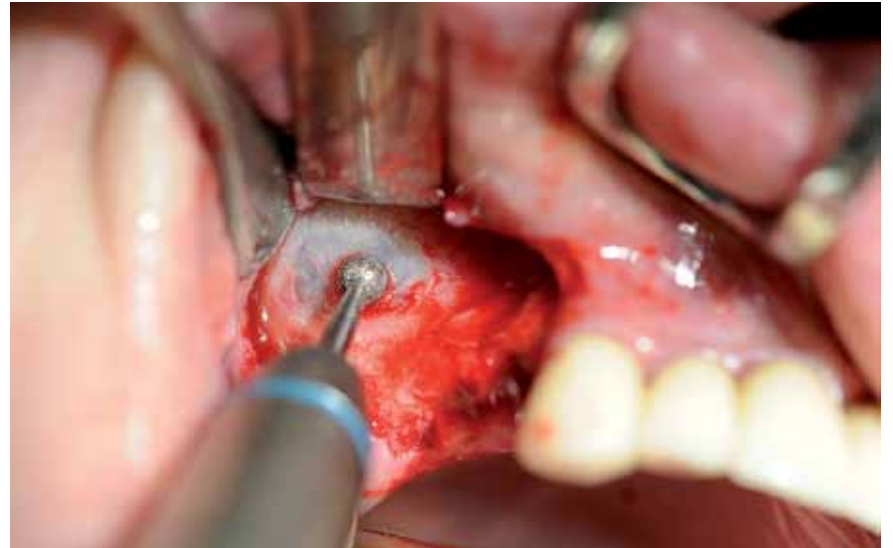
Fig. 5: Careful dissection of the Schneiderian membrane by the use of a diamond bur.

For the final wound care, the defect is covered passively with the lobes. For this purpose, releasing incisions