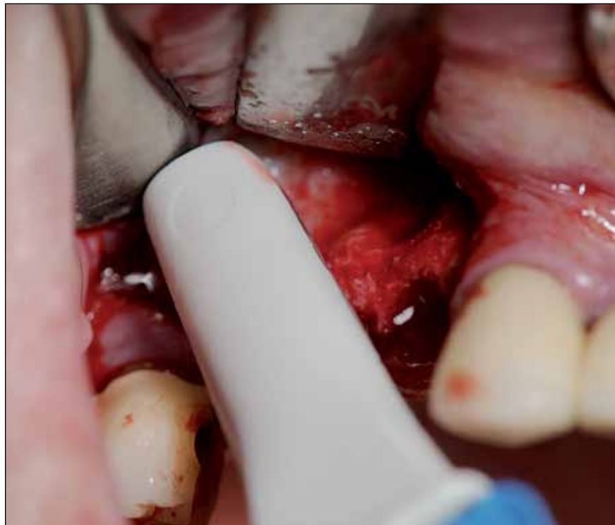
→ IT page 4 Fig. 4: Extraction of the patient's own (autologous) bone chips by Safescraper.