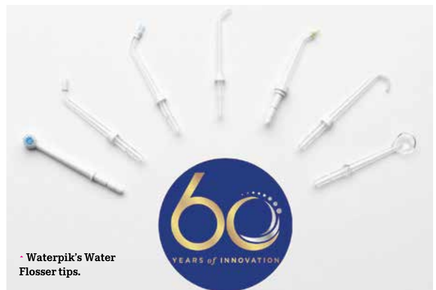
• Waterpik's Water Flosser tips.