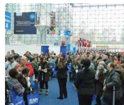
• Attendees at the 95 th annual Greater New York Dental Meeting await the countdown to the opening of the exhibit hall Sunday morning, the first day of the 2019 meeting's four days of exhibits.

Just two more days until the exhibit hall closes for another year, so be sure to grab these deals and more while they're available.