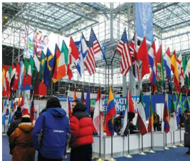
• The entrance to International Registration at the Greater New York Dental Meeting.