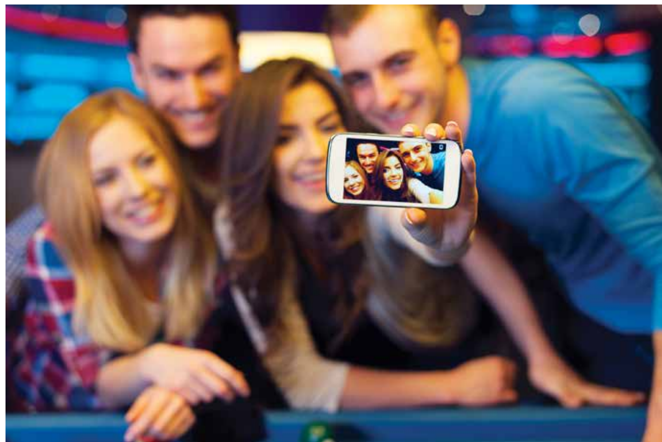
• Share your Hinman thoughts and experiences on social media using the #MyHinman hashtag, and you can help raise money for student scholarships.

In addition, the New Product Showcase will be open from 9 a.m. to noon Friday. Designed for the entire dental team and open to all attendees at no fee, 18 companies will present the latest products and services in an informative, non-commercial manner.