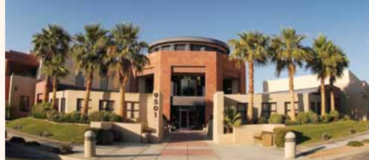
The Las Vegas Institute for Advanced Dental Studies in Las Vegas.

As a way to introduce you to the Las Vegas Institute for Advanced Dental Studies, or LVI, I want to outline what LVI is