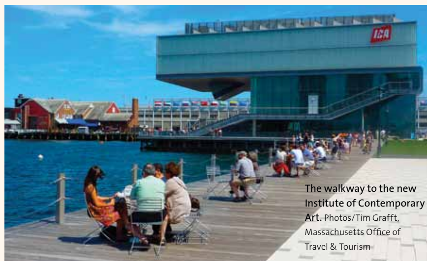
The walkway to the new Institute of Contemporary Art.