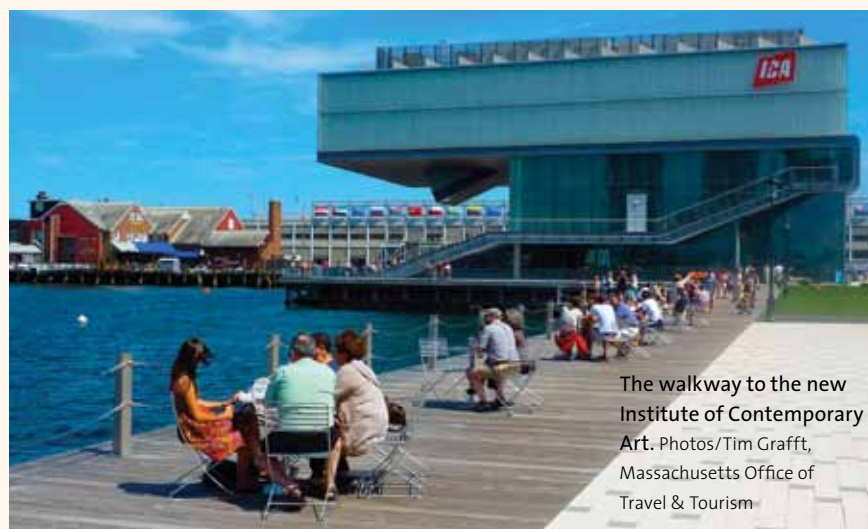
The walkway to the new Institute of Contemporary Art.