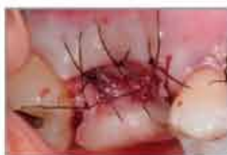
Sutured Without Primary Closure