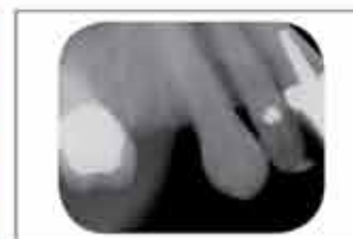
16 Week X-Ray Ideal Bone Formation