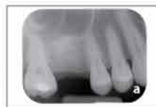
16 Week X-Ray Ideal Bone Formation