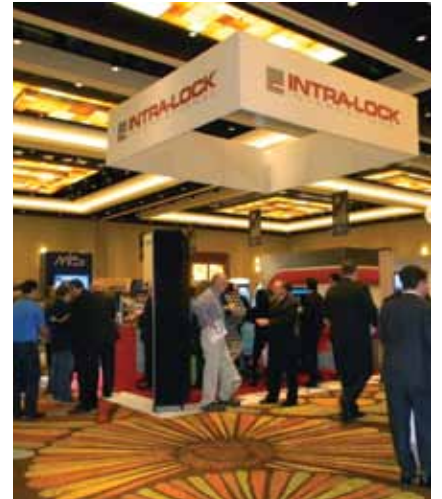
• Attendees mill around the exhibit hall on Thursday evening.