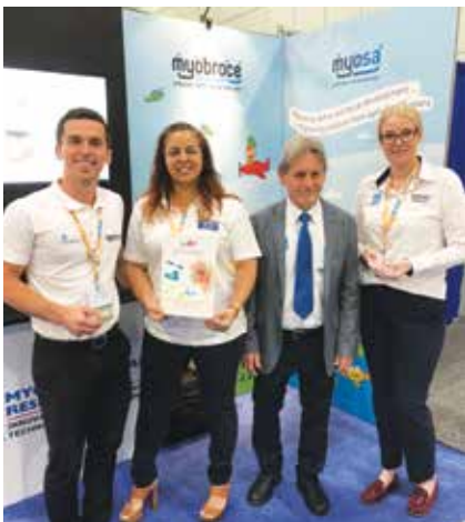
Visit the team of the Myofunctional Research booth (No. 811) to learn about appliances to correct malocclusion.