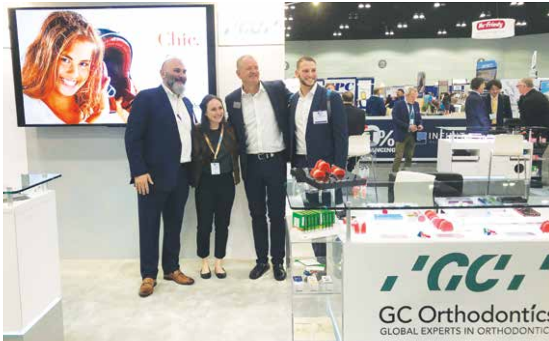
At right, GC Orthodontics America officials take time out for a photo op with attendees Saturday morning at booth No. 2247.