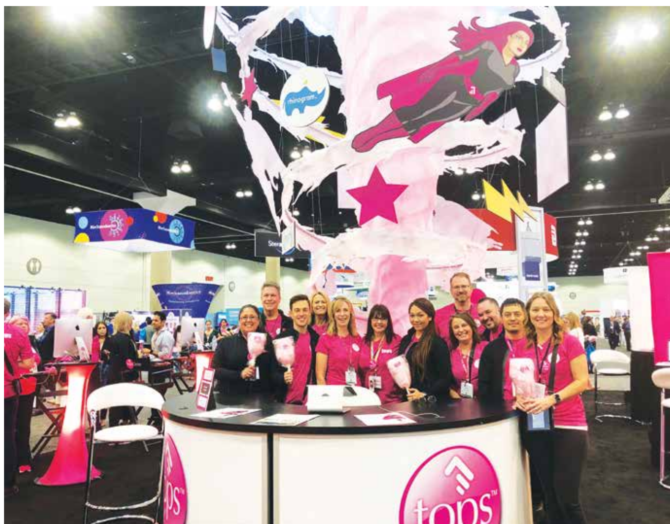
No trip to the AAO is ever complete without a stop by the tops Software booth, No. 1637! Grab some cotton candy, some sassy pins and find out why tops Software is the superhero behind so many practices.