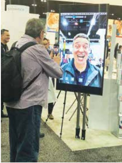
Head over to the Dolphin booth (Nos. 1025/1125) and try out the software where you can see what you'll look like with braces or with perfect teeth post-treatment!