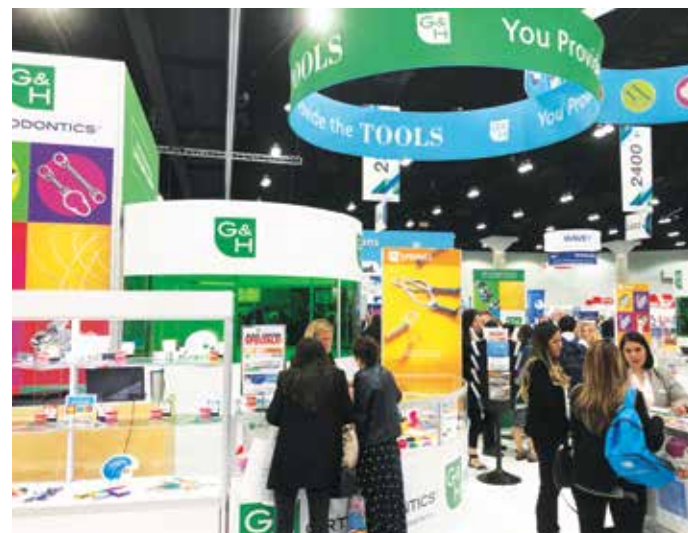
Attendees keep things busy at the G&H booth, No. 2213.