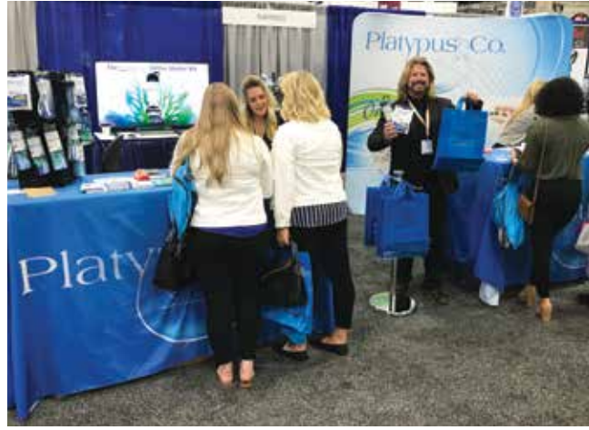
Stop by the Platypus booth, No. 839, for deals on a variety of orthodontic products.