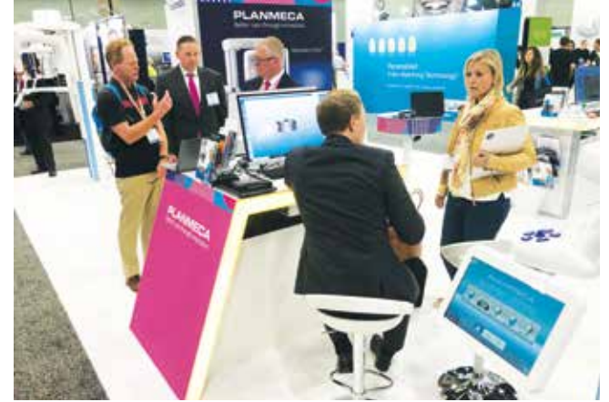
Be sure to spend time at the Planmeca booth (No. 1547), like these attendees, to get a glimpse of the company's full line of 2-D and 3-D imaging and scanning products.