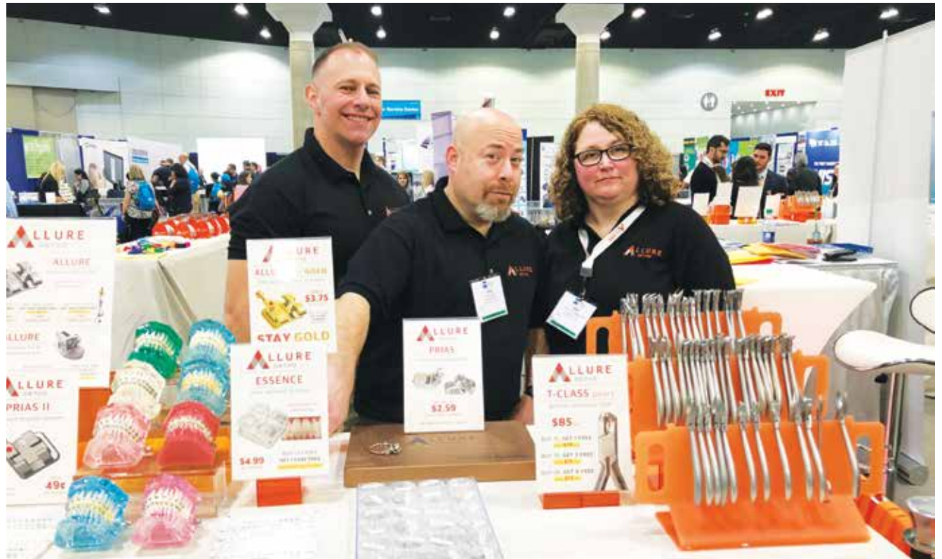
Visit Allure at booth No. 525 for top-quality brackets and pliers at affordable prices.