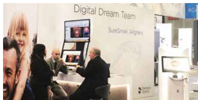
Dentsply Sirona Orthodontics (booth No. 1301), including GAC and Raintree Essix, keeps things running smoothly with digital treatment planning.