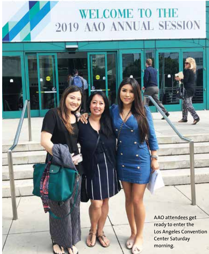
AAO attendees get ready to enter the Los Angeles Convention Center Saturday morning.