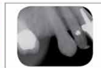
16 Week X-Ray Ideal Bone Formation