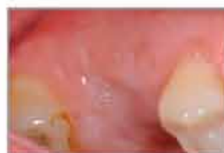
16 Week Post-Op Mature Tissue Closure