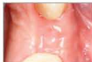
4 Week Post-Op Mature Tissue Closure