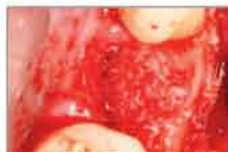
Grafted Extraction Socket