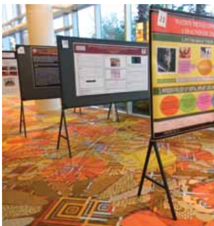
• Catch the poster sessions outside the exhibit hall.