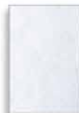
20mm x 30mm

Extra 5mm Length Allows Buccal-Lingual Coverage