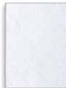
30mm x 40mm