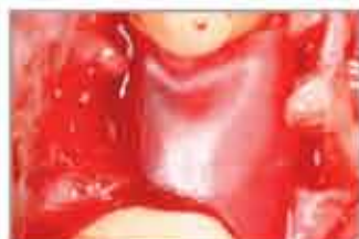
Renovix ® Draped Over Surgical Site