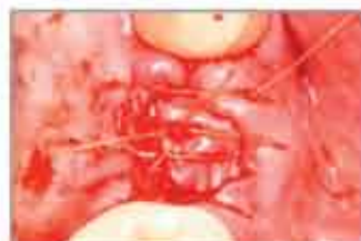
Sutured Without Primary Closure