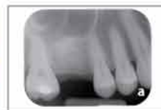
16 Week X-Ray Ideal Bone Formation