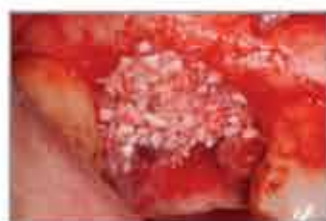
Grafted Extraction Socket