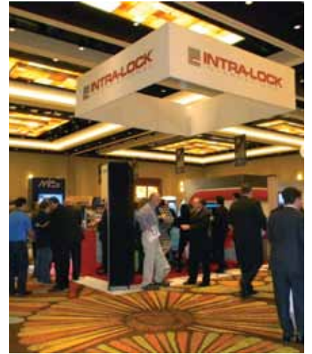
• Attendees mill around the exhibit hall on Thursday evening.