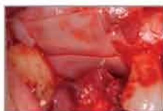
Renovix ® Placed Double Layer