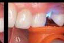
Light cure Liquid Magic™ Resin Barrier for 15 seconds.