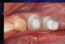
Liquid Magic™ Resin Barrier light cure. Protects abutments & implant components.