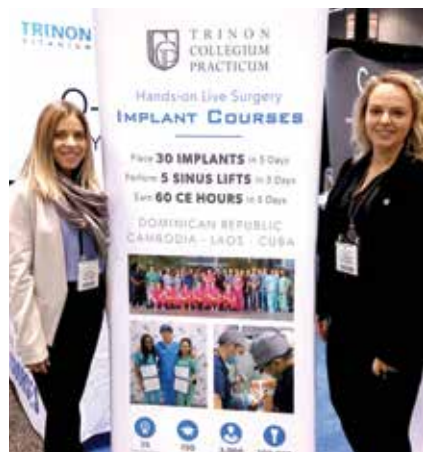
• Visit Trilon Collegium Practicum to learn about hands-on implant courses.