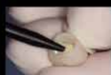
ZERO-G™ Bio-Implant Cement is loaded into restoration.