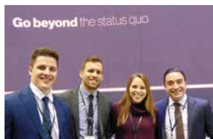
• The folks at Invisalign iTero (booth No. 5011).