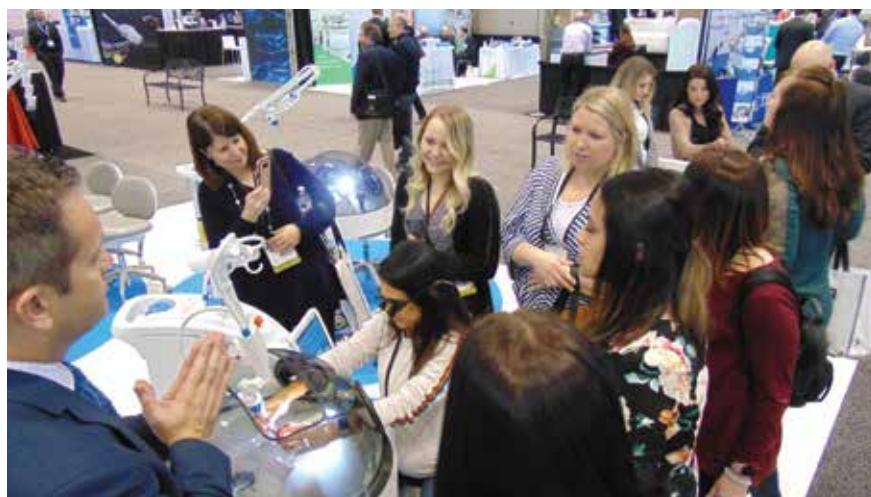
• Meeting attendees learn about laser technology options at Convergent Dental (booth No. 1643).