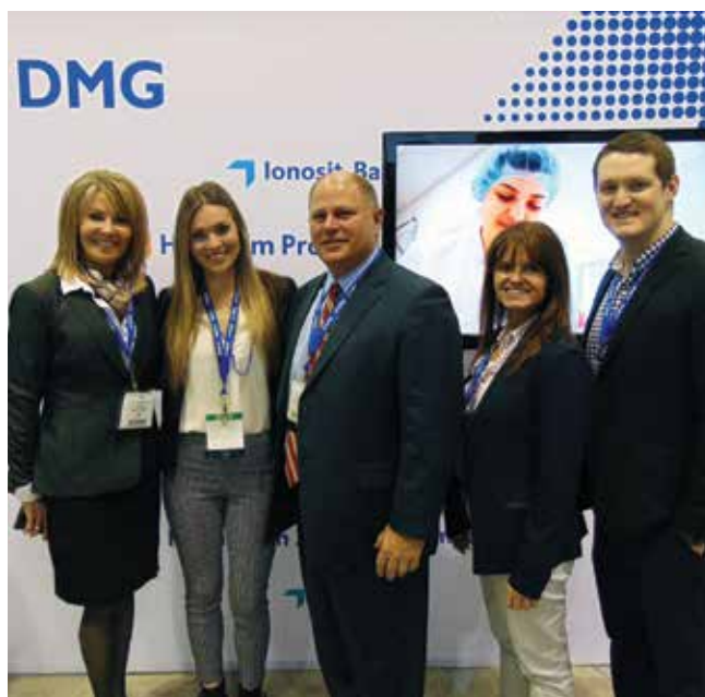
• The gang from DMG (booth No. 1611).