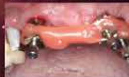
STELLAR™ DC Acrylic is easily placed and layered by tack cure.