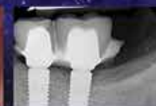
Excess cement showing radiopacity before clean up.