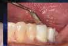
Restorations are placed. Excess cement with great color contrast is visible.