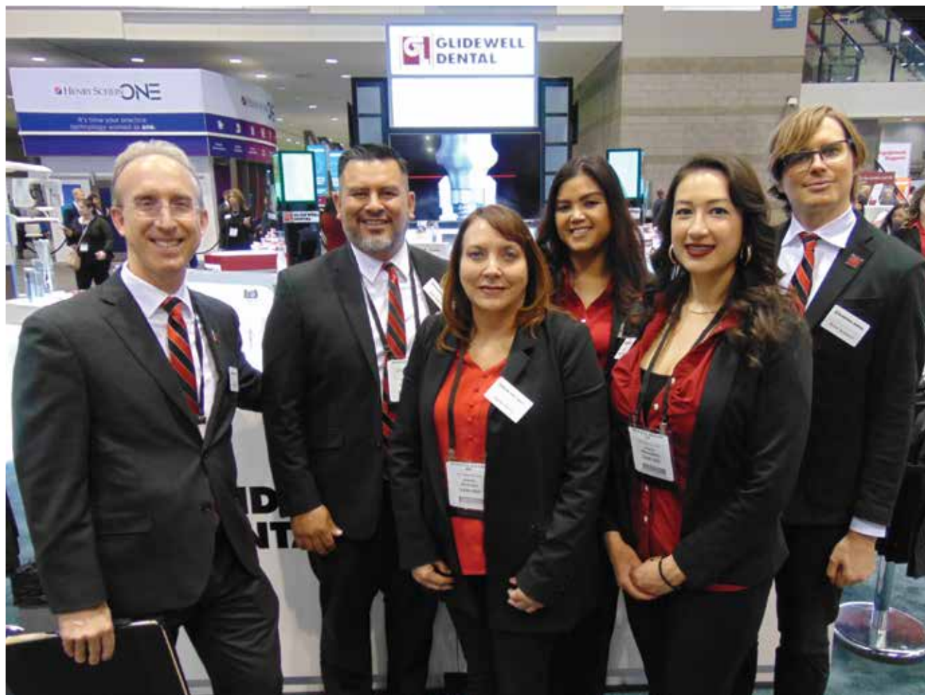
• The team members from Glidewell gather for a group photograph at their booth (No. 3219).