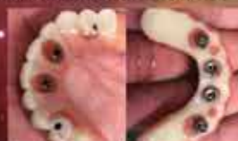
Completed conversion. "Rock Hard" Durability. No fractures, no rebuilds.