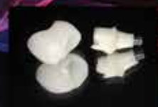
Restoration and Zirconia abutment.