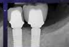
Post-Op showing no excess cement. Final restoration is retrievable when needed.

Peri-Implantitis is a leading cause of implant failure. Excess cement that is not visible and is left behind can cause irritation of the surrounding tissue, which may lead to bacterial growth, bone loss, and possible failure of the restoration.