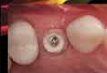
Abutment before preparation.