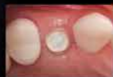
Cured Liquid Magic™ Resin Barrier. Abutment ready for final insert of restoration.