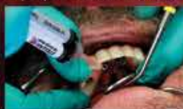
Denture placed and STELLAR™ DC Acrylic is injected and tack cured. Pick-up in seconds.