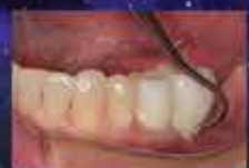
Dual Cure: Remove excess cement easily. 2 minutes 30 seconds full set.