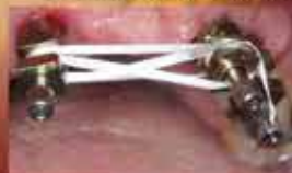
Floss is applied around copings to become internal framework of verification jig.