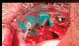
CHROME GuidedSMILE Stackable Guide System. Keystone TI Chimneys are torqued to spec.