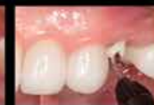
Fill abutment with Liquid Magic™ Resin Barrier.