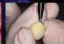
ZERO-G™ Bio-Implant Cement is loaded into crown.