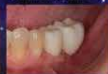
ZERO-G™ Bio-Implant Cement offers simple clean up and easy removal of excess cement.