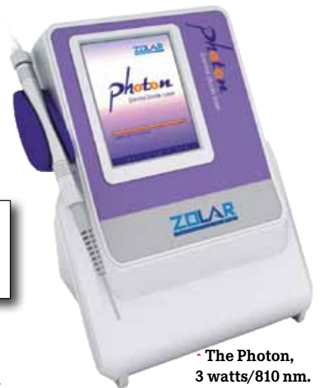
• The Photon, 3 watts/810 nm.