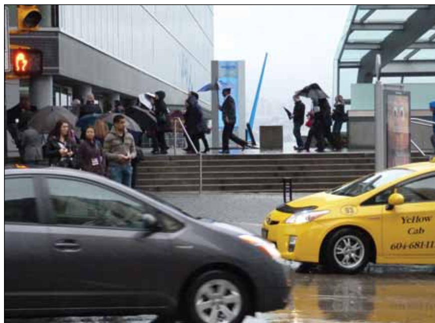
• PDC attendees lower their umbrellas Thursday morning as they prepare to enter the Vancouver Convention Centre.