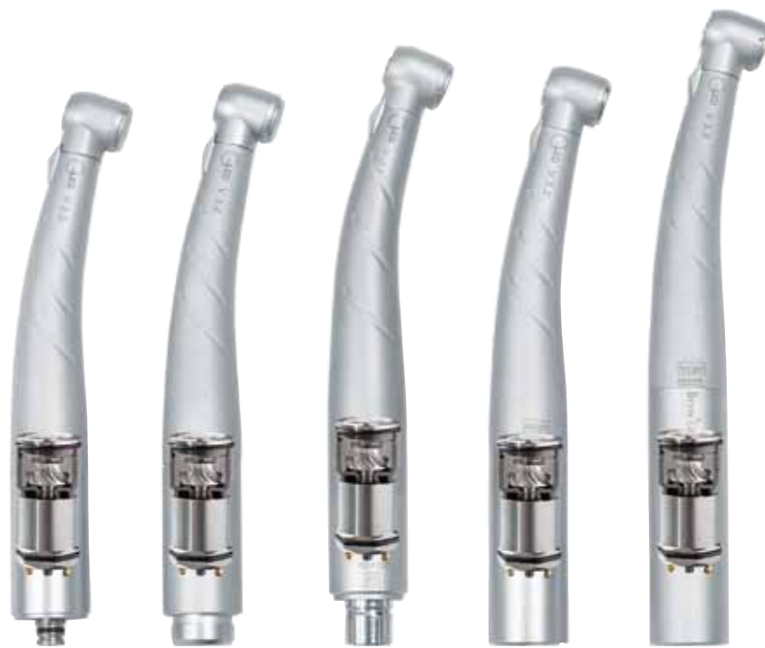
• The AirLight V3.

The company serves dental communities in Canada, the United States, Colombia, Argentina, Mexico and elsewhere.