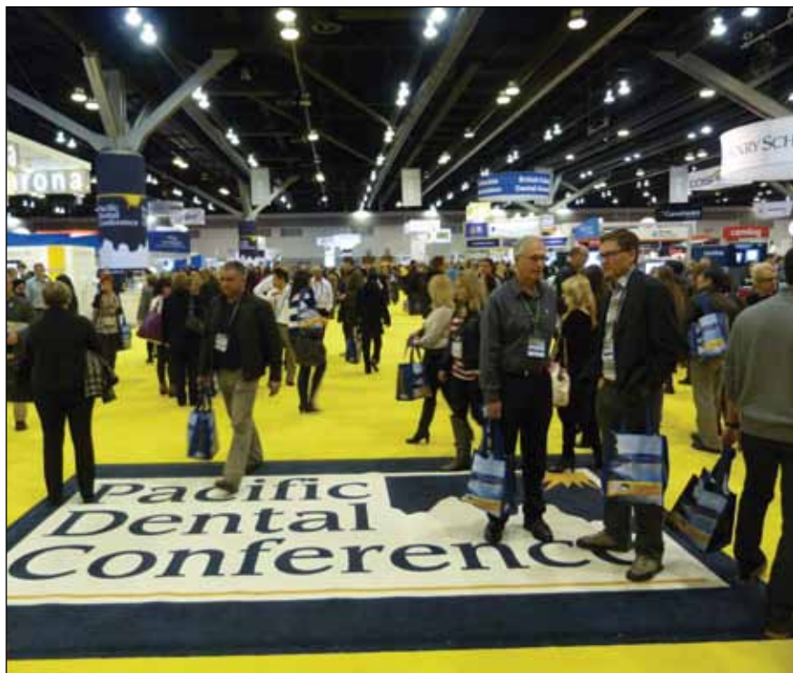
• The extra-wide main aisles of the PDC Exhibit Hall are put to use Thursday with attendees streaming in for a complimentary lunch, live dentistry and endless displays of the latest products and services. There's much more of the same today.