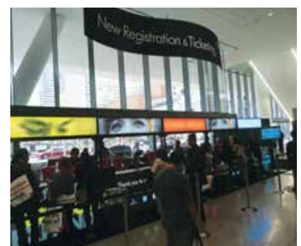
• CDA Presents registration continues through Saturday, with plenty of educational opportunities available each day.