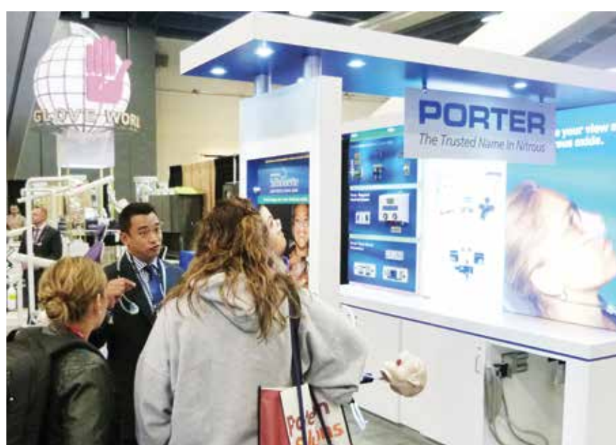
• Learn about an easier way to deliver nitrous oxide at the Porter Instrument booth, No. 1628.