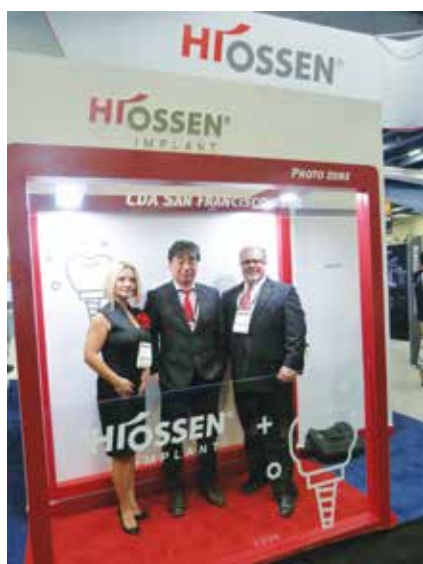
• Stop and take a picture in the photo booth at the HiOssen booth, No. 1234, to mark your CDA trip.