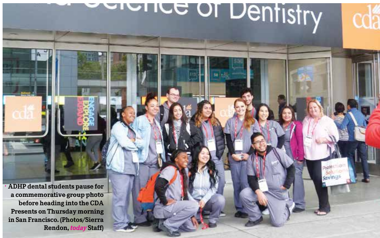
ADHP dental students pause for a commemorative group photo before heading into the CDA Presents on Thursday morning in San Francisco.