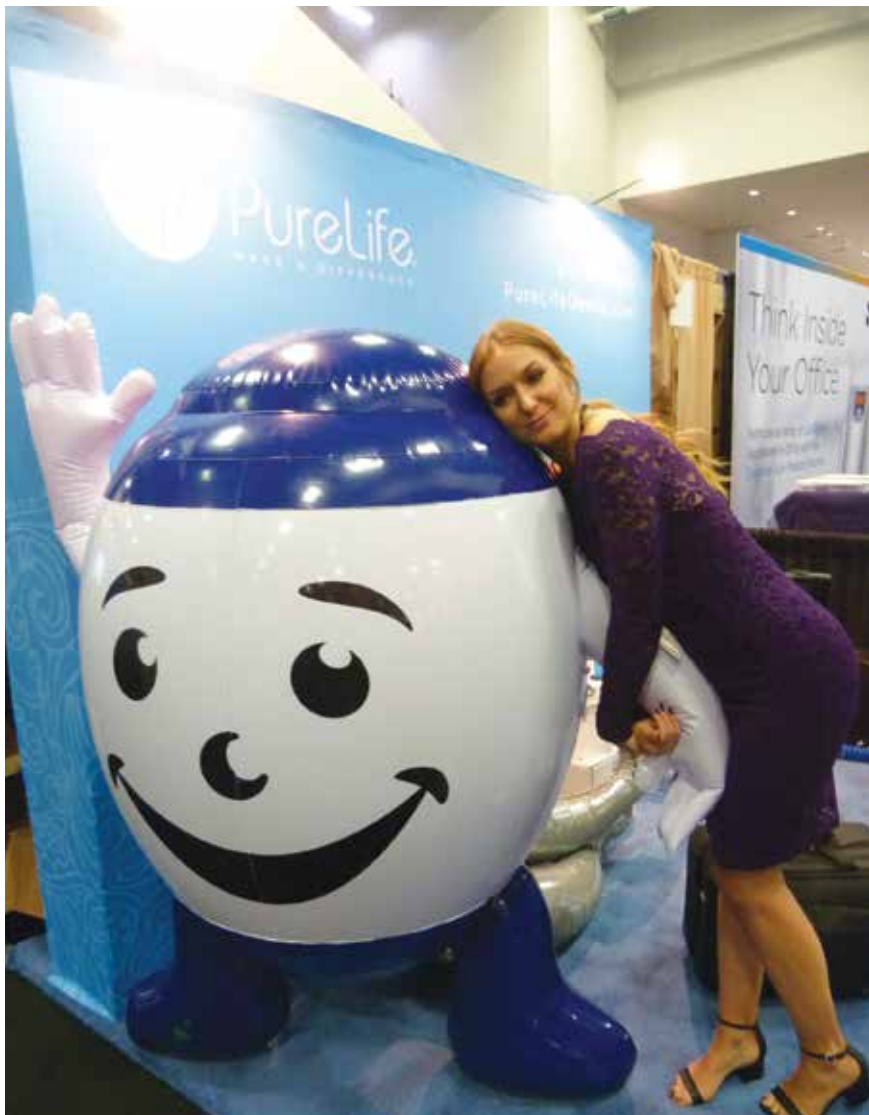
• Want to win an Apple Watch or other fun prizes? Stop by PureLife Dental, booth Nos. 808/1609, and take a picture with this cuddly guy (ECO II Man). Then post it to Twitter or Instagram with #eco2man and #cdaSF, and you could win big!