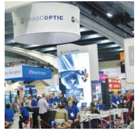
• The Orascoptic booth, No. 702, stays busy Thursday in the exhibit hall.