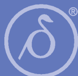
Denar Mark 330 Slidematic Facebow

The Mark 330 brings a new standard of interchangeability with factory set accuracy within 20 microns.