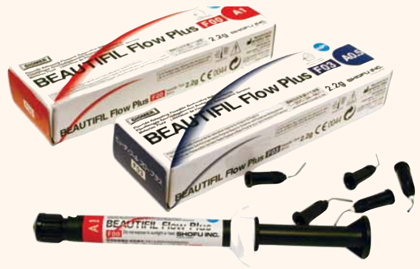
Fig. 1: Newly approved in Canada, BEAUTIFIL Flow Plus radiopaque, an injectable hybrid restorative, combines mechanical properties that rival leading hybrids.

As published in JADA, a University of Florida study found that restorations containing S-PRG filler showed no failures, no secondary caries and no post-op sensitivity over an eight-year period.