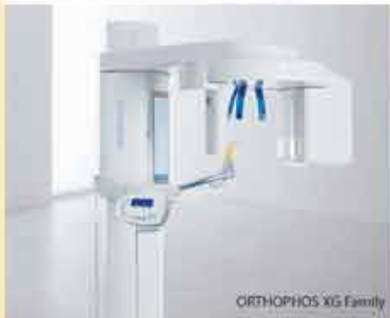
ORTHOPHOS XG Family