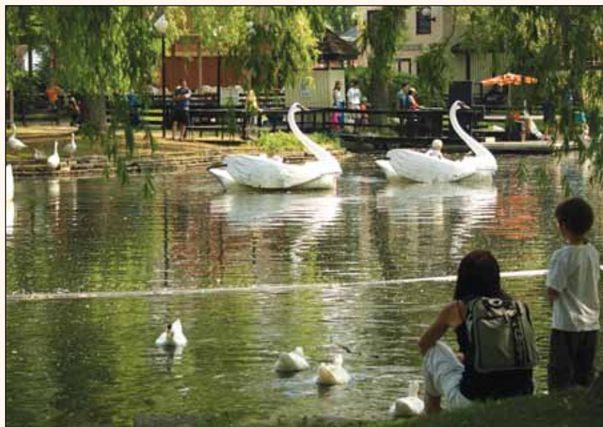
If you have at least two people and one them is at least four feet tall, you qualify for the swan boat rides at Centreville Amusement Park on Toronto Islands.