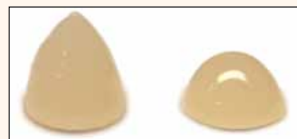
Fig. 4: "F00" Zero Flow (0.0 mm of flow held vertically for one minute), left, is ideal for stacking, especially in the marginal ridge. "F03" Low Flow (3 mm of flow held vertically for one minute), right, handles more like a traditional base or liner.

A 13-year recall of these patients is currently under way.