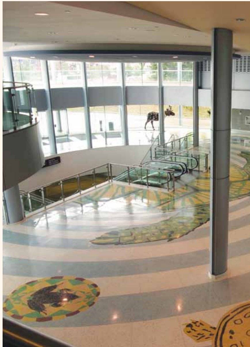
The Metro Toronto Convention Centre South Building ceremonial entrance features sculptures, murals, terrazzo flooring and other Canadian art.