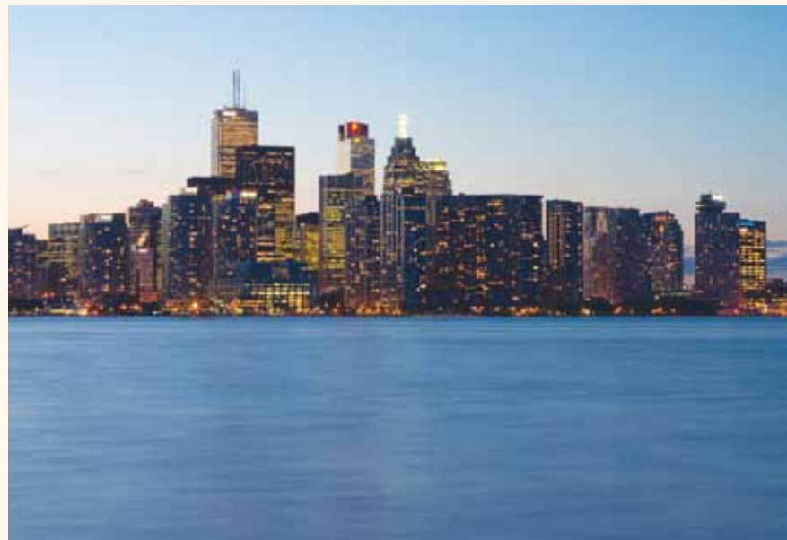
North America's biggest single-day dental convention, the Toronto Academy of Dentistry Winter Clinic, celebrates 75 years on Friday, Nov. 2.