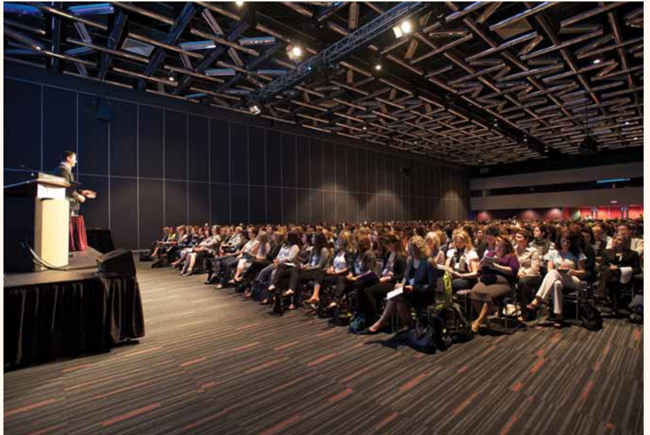
The JDIQ scientific program offers a choice of more than 100 lectures in both English and French.

The general attendance courses and exhibition floor featuring more than 325 booths are open to all participants for one registration fee. All lectures