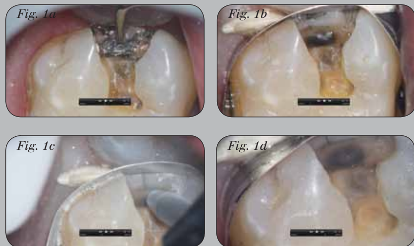
Case No. 1: Removal of amalgam stain and micro crack discovery