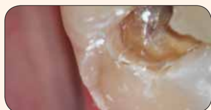
Fig. 4: Case No. 4, #31, severely cracked tooth with no pain.

The four simple cases presented here illustrate how using multiple magnifications allows the general dentist to exceed his or her ability to see beyond one's eyesight or loop magnification. D