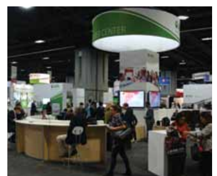
• Meeting attendees stop to recharge in the ADA Member Center on the exhibit hall floor.