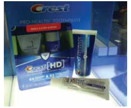
• Consumer products on display at Crest + Oral-B (booth No. 2501).