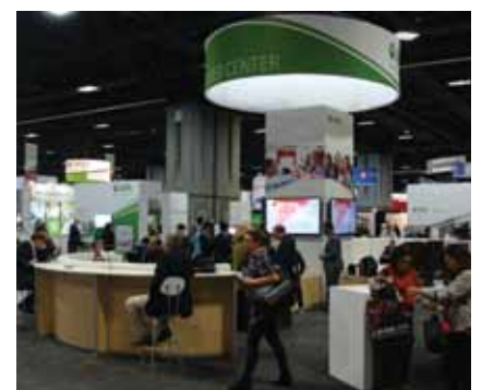
• Meeting attendees stop to recharge in the ADA Member Center on the exhibit hall floor.