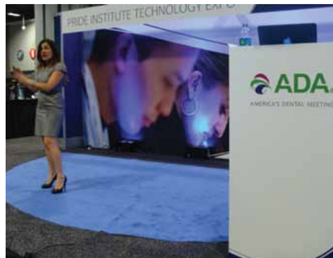
• A speaker offers an educational presentation in the Pride Institute Technology Expo on the exhibit hall floor.