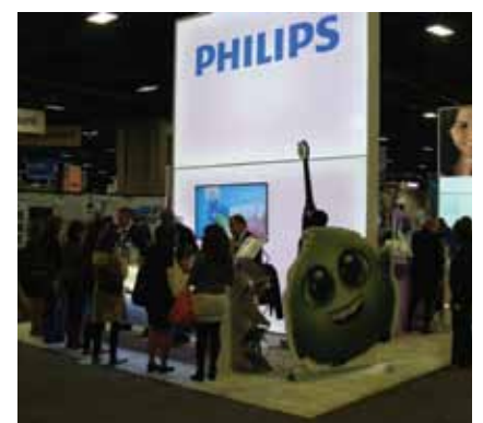
• Philips Sonicare and Zoom! Whitening (booth No. 605).