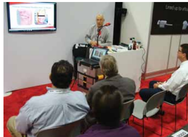
• A speaker offers an educational presentation to meeting attendees at Nobel Biocare (booth No. 3000).