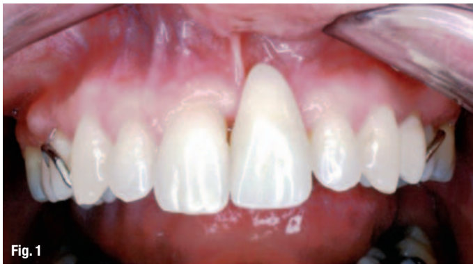
Fig. 1 _Initial labial view of maxillary #9 edentulous area with a flipper.