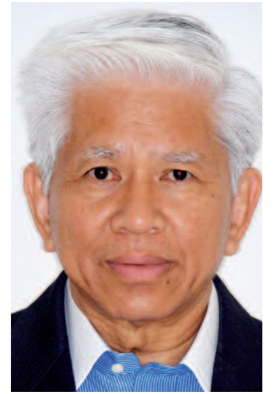
Prof. Prathip Phantumvanit, Thailand

Fluorescence) in order to detect mineral loss in enamel, as well as follow-up strategies, such as remineralisation and the use of sealant. Moreover, the visual FDI Caries Matrix, in terms of non-cavitated and cavitated lesions in enamel and dentine, has been proposed as a caries index for timely prevention and treatment. This early detection and diagnosis of dental caries will lead to proper prevention and control of caries before the development of a cavity, which can then only be treated.