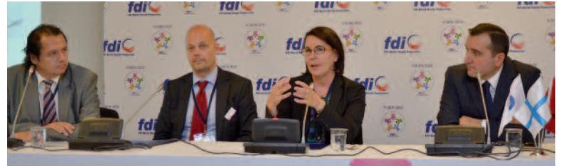
■ Representatives from both companies also talked about the new partnership at a press conference held yesterday in the Istanbul Congress Center.

Plandent's mission is to offer the latest technology and materials from