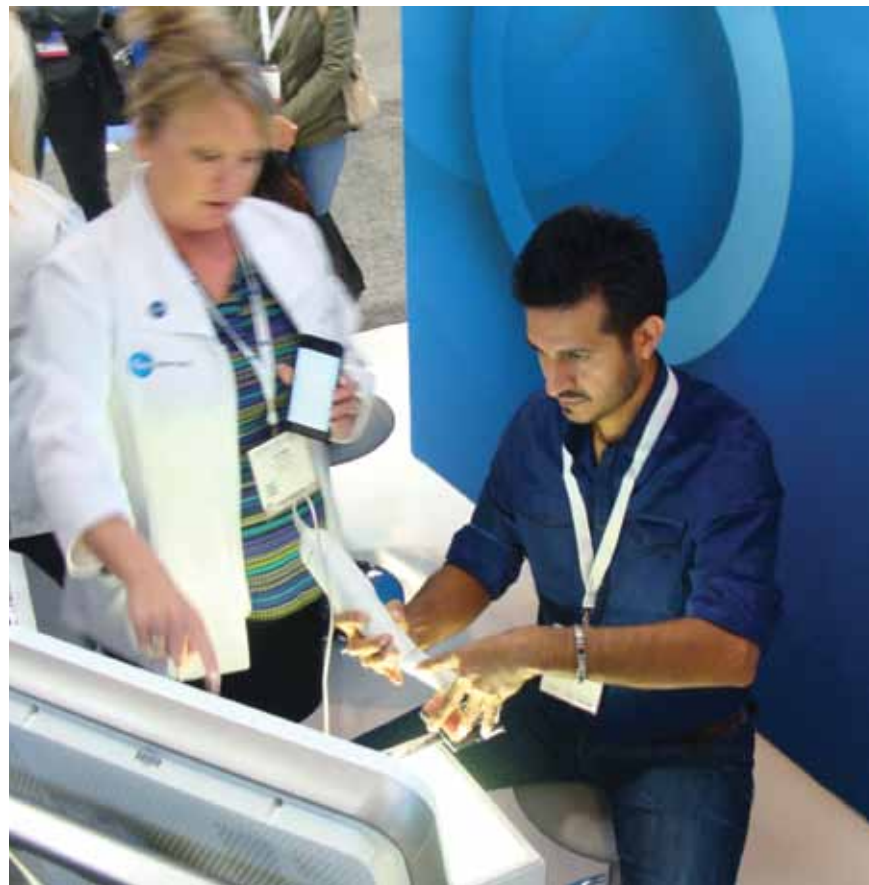
• A meeting attendee gets hands-on experience with scanning equipment at iTero (booth No. 1001).