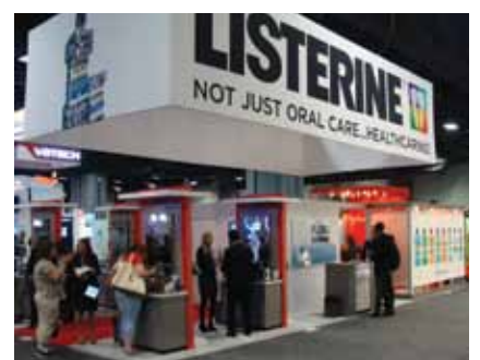
• Johnson & Johnson Consumer (booth No. 737).