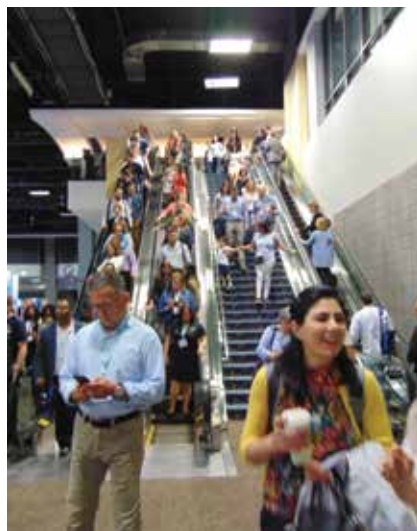
After courses let out Saturday morning, AAO attendees come down the escalators to the exhibit hall.