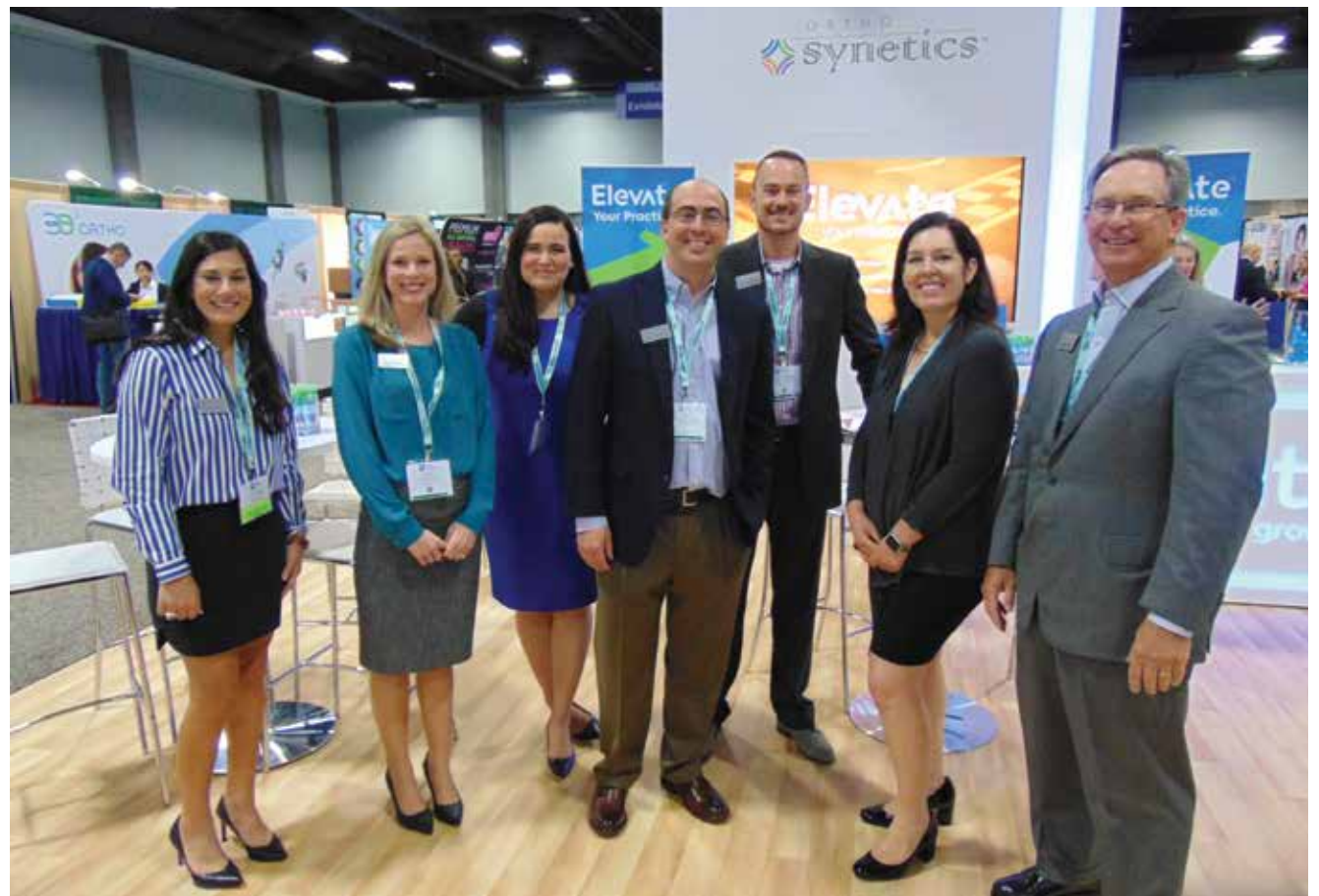
The gang at OrthoSynetics (booth No. 2137).