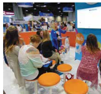
Meeting participants attend an educational presentation at PracticeGenius (booth No. 2333).