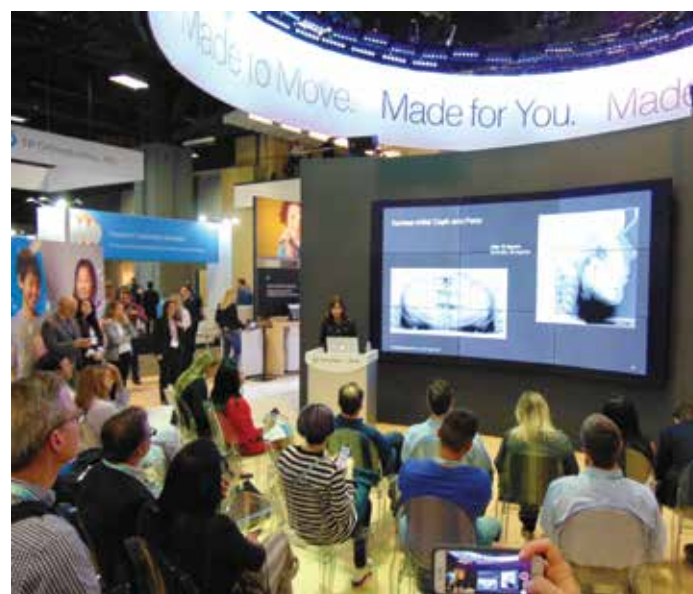
Orthodontic professionals attend an educational presentation Saturday morning at the Invisalign iTero booth (No. 501).

Check your program guide or download the AAO app for times and locations.