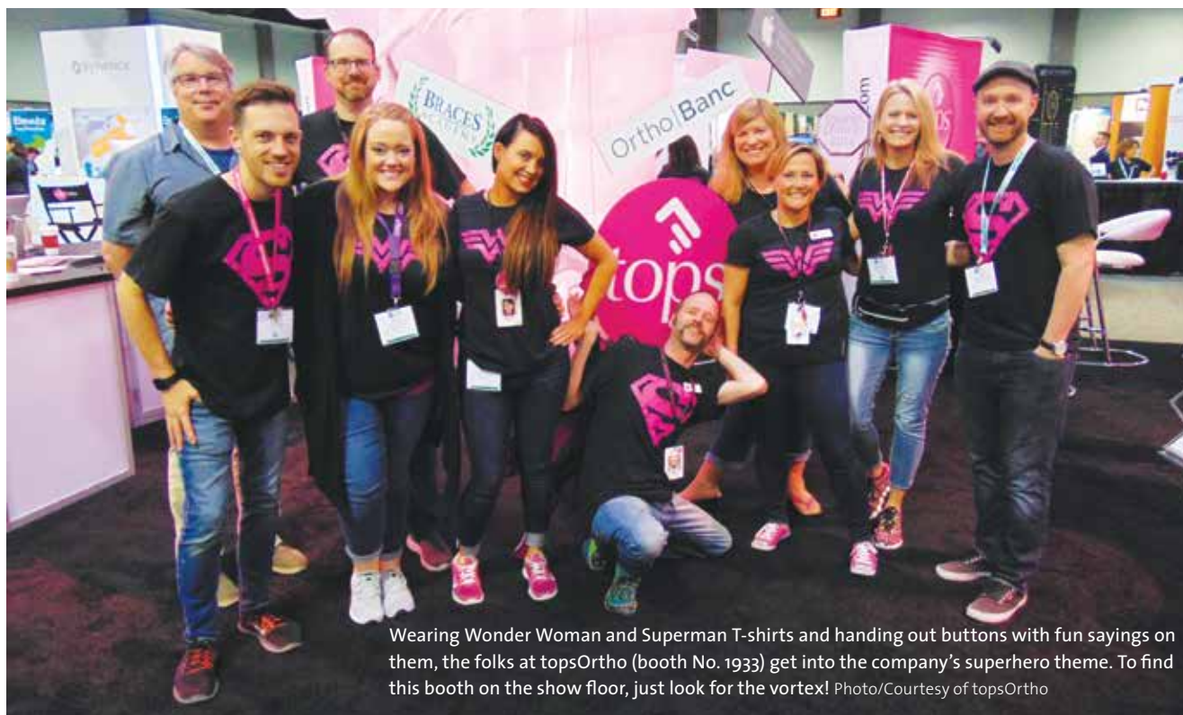
Wearing Wonder Woman and Superman T-shirts and handing out buttons with fun sayings on them, the folks at topsOrtho (booth No. 1933) get into the company's superhero theme. To find this booth on the show floor, just look for the vortex!