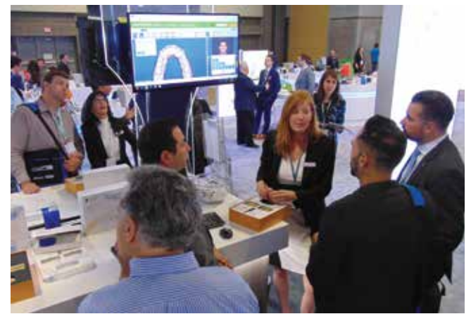
Meeting attendees get more information about the SureSmile aligner system at the Dentsply Sirona Orthodontics booth (No. 901).