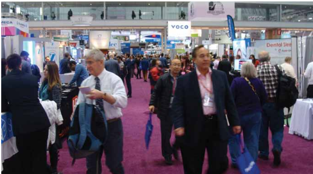
• Meeting attendees visit the exhibit hall Friday morning.