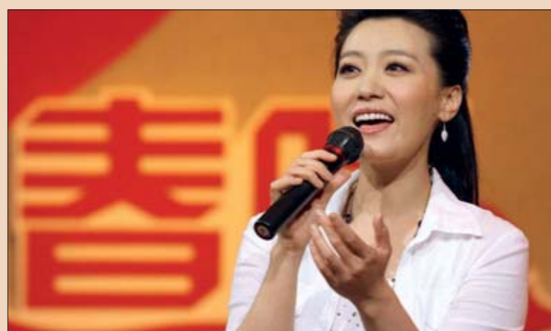
Tan Jing (China) performing at a Spring Festival concert in Beijing. The 33-year old celebrity singer has been appointed ambassador for a new oral health awareness campaign by the Chinese government.

The latest research has indicated that adult stem cells, which can also be extracted from bone marrow and other parts of the human body, have the potential to treat non-communicable diseases like cancer or heart disease and to repair or regenerate entire organs. Dental Pulp Stem Cells have been found to form at least 29 different unique tissues, including dental enamel, dentine, blood vessels and nerve cells. DTI