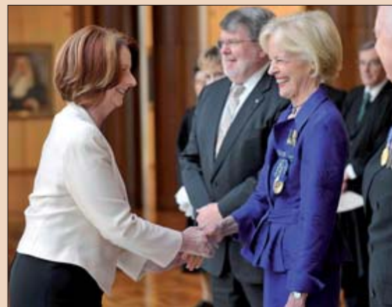
Prime Minister Julia Gillard (left) greeting members of the new Parliament.

After two weeks of political deadlock, Labor recently regained power by winning support