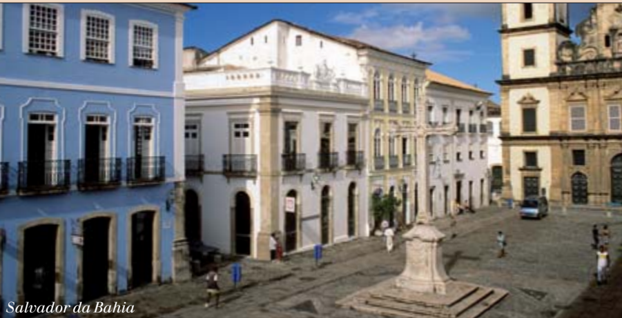
Salvador da Bahia