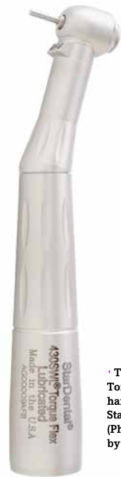
• The 430SWL Torque Flex handpiece from StarDental.

DentaleZ manufactures a full line of products and brands, including StarDental, DentaleZ Equipment, RAMVAC®, NevinLabs™ and Columbia Dentoform®. For more information, visit www.dentalez.com .