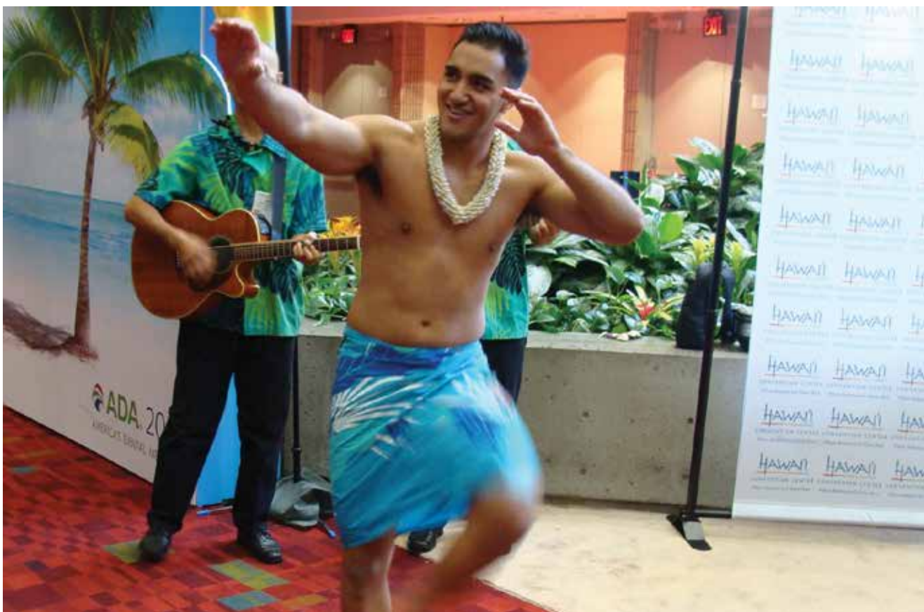
• To greet dentists and visitors to Honolulu to ADA 2018 – America's Dental Meeting, the ADA will host 'Some Enchanted Evening: A Welcome Celebration' at the Waikiki Shell today from 5:30 to 9 p.m., billed as a musical celebration of the many cultures that call Hawaii home.