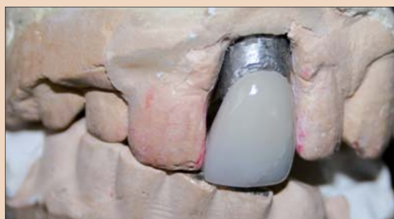
This dental crown made for Elvis Presley by his dentist was recently auctioned together with a dental impression of the "King of Rock and Roll" to a Canadian dentist. ▶ WORLD NEWS, page 5

Dental technician associations have criticised the regulations, which they fear could put many dental workers out of business and reduce the opportunities for middle- and lower-income patients to receive dental treatment at all. The costs for dental procedures offered by a tukang gigi are usually four to five times lower than treatment by a regular dentist. DTI