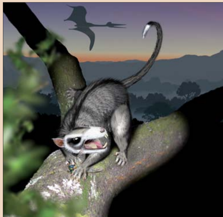
An artist's conception depicts a multituberculate in its natural habitat at the time of the dinosaurs.