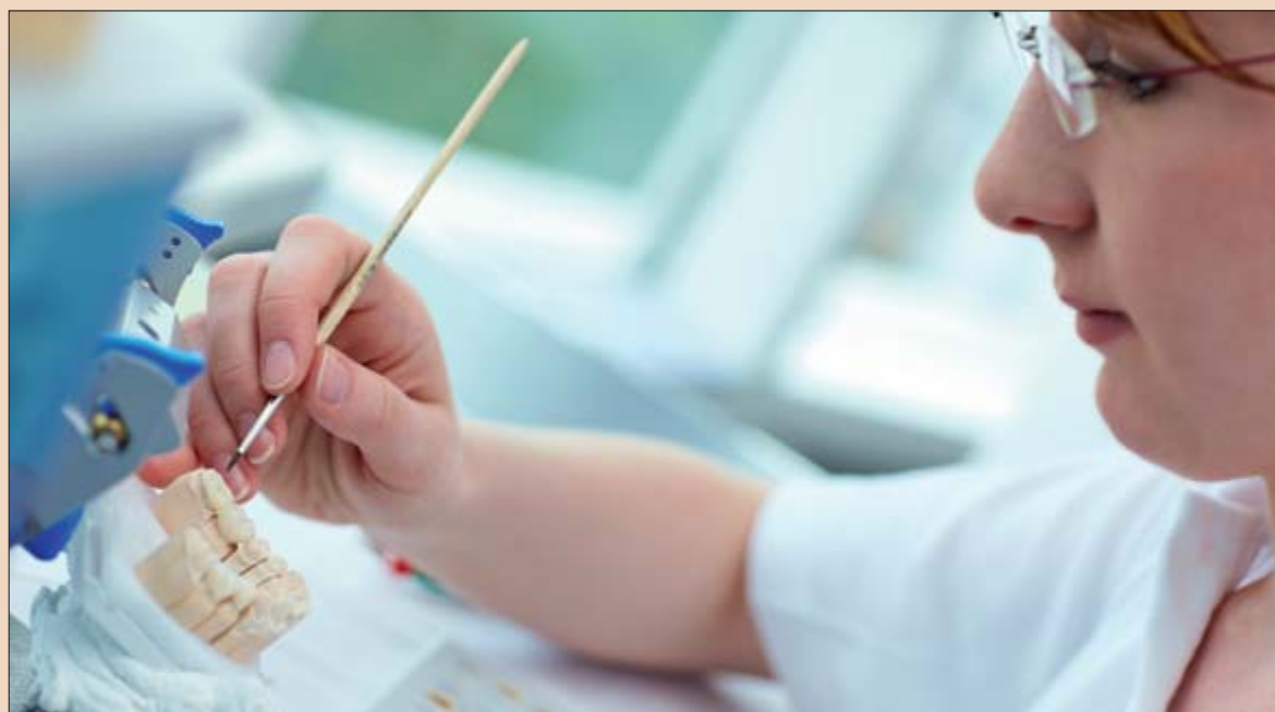
Dental technicians are exposed to high concentrations of acrylates.