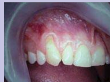
Fig. 1: Pre-op labial view of anterior teeth: recession on tooth #6; tooth #7 surrounded by a small adequate zone of keratinised apical tissue.

bule. 19 The subsequent healing usually resulted in an increase of AG. However, within six months, as much as a 50 per cent relapse