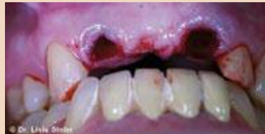
Clinical picture showing the alveolae immediate after the atraumatic extraction

The alveolae were thoroughly scooped and cleaned. Available bone was sounded and found adequate for immediate implant placement. Two Biohorizons Ø4.0mm x 12mm external implants were inserted in the al-