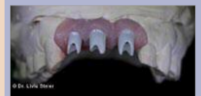
Picture showing the master model with gingival mask and ceramic abutments