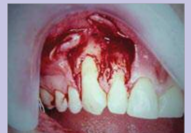
Fig. 2: Flaps reflected preserve the interproximal tissue, which preserves the blood supply and prevents black triangles (unesthetic interproximal spaces).