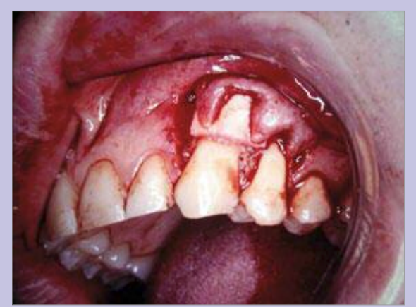
Fig. 8: GTR membrane placed over the root surface of tooth #11 only; no membrane was placed on the surface of the recession of tooth #12.