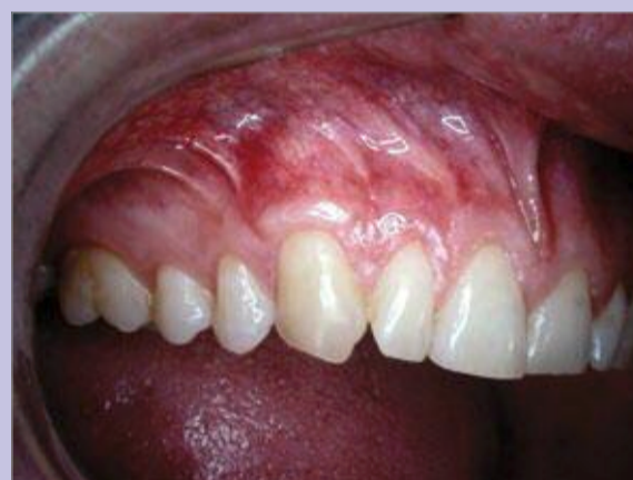
Fig. 5: Post-op view: the previously recessed roots of teeth #6 and #7 are covered with attached pink, keratinized gingival tissue, with no pocket depth upon probing.