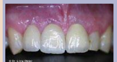
Clinical picture at six months recall showing optimal soft tissue conditions, nice interdental papillae and natural emergence profile