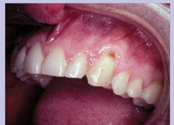
Fig. 6: Pre-op labial view of anterior teeth, with no pocket depth upon probing.