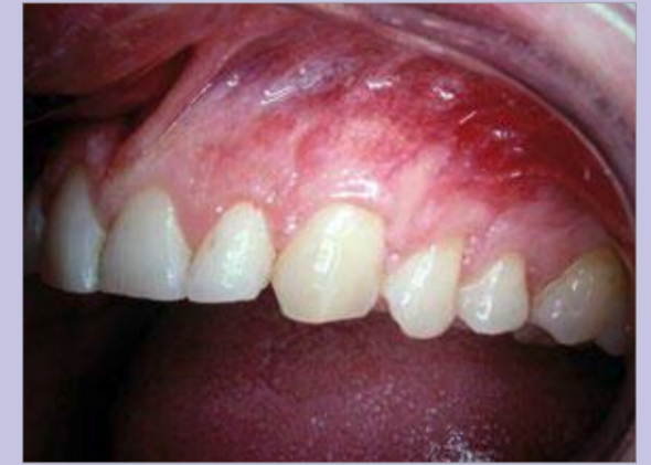
Fig. 10: Post-op view.

ess of a new connective tissue attachment. In order to increase root coverage, a new clinical attachment is necessary.