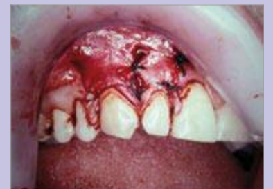
Fig. 4: Gingival tissue was coronally repositioned, covering the membranes and the roots of teeth #6 and #7, and sutured in place.