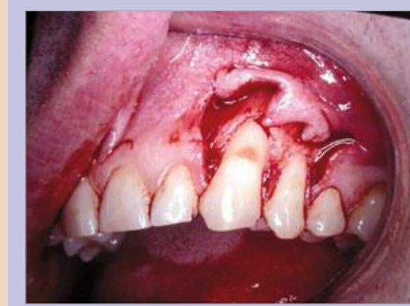
Fig. 7: Cervical groove on tooth #11 is solid, hard and non-carious.

Variations in muco-gingival procedures have been developed to include root surface bio-modifications by treating the root surfaces with a variety of materials. These measures enhance the regeneration proc-