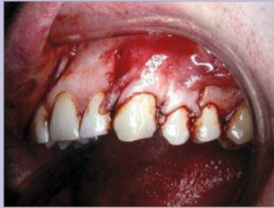
Fig. 9: Gingival tissue coronally repositioned to cover the GTR membrane on tooth #11 and tooth #12.