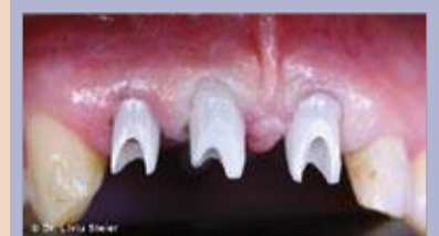
Direct clinical picture showing the ideal contour with adequate scalloped margins having thick collar and superbly mimicking natural conditions