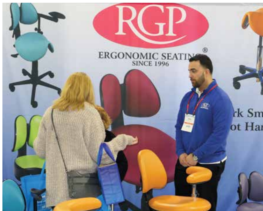
• The perfect chair is waiting for you at the RGP booth, No. 637. Come test one — or all — of them out today.