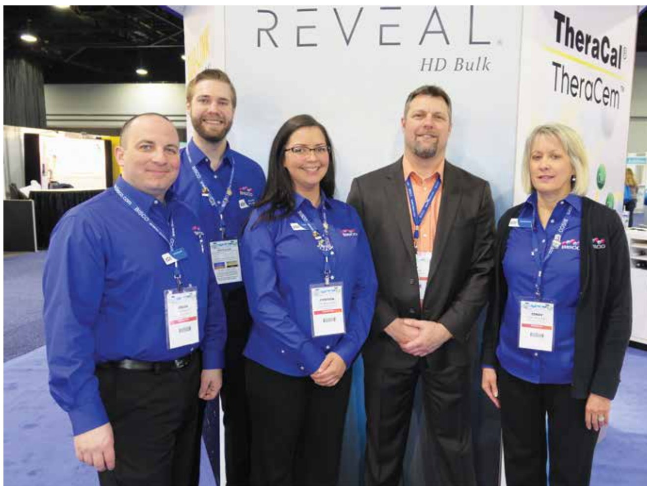
• The team at Bisco (booth No. 1337) has a new bulk fill composite, REVEAL HD, for you to come test out.