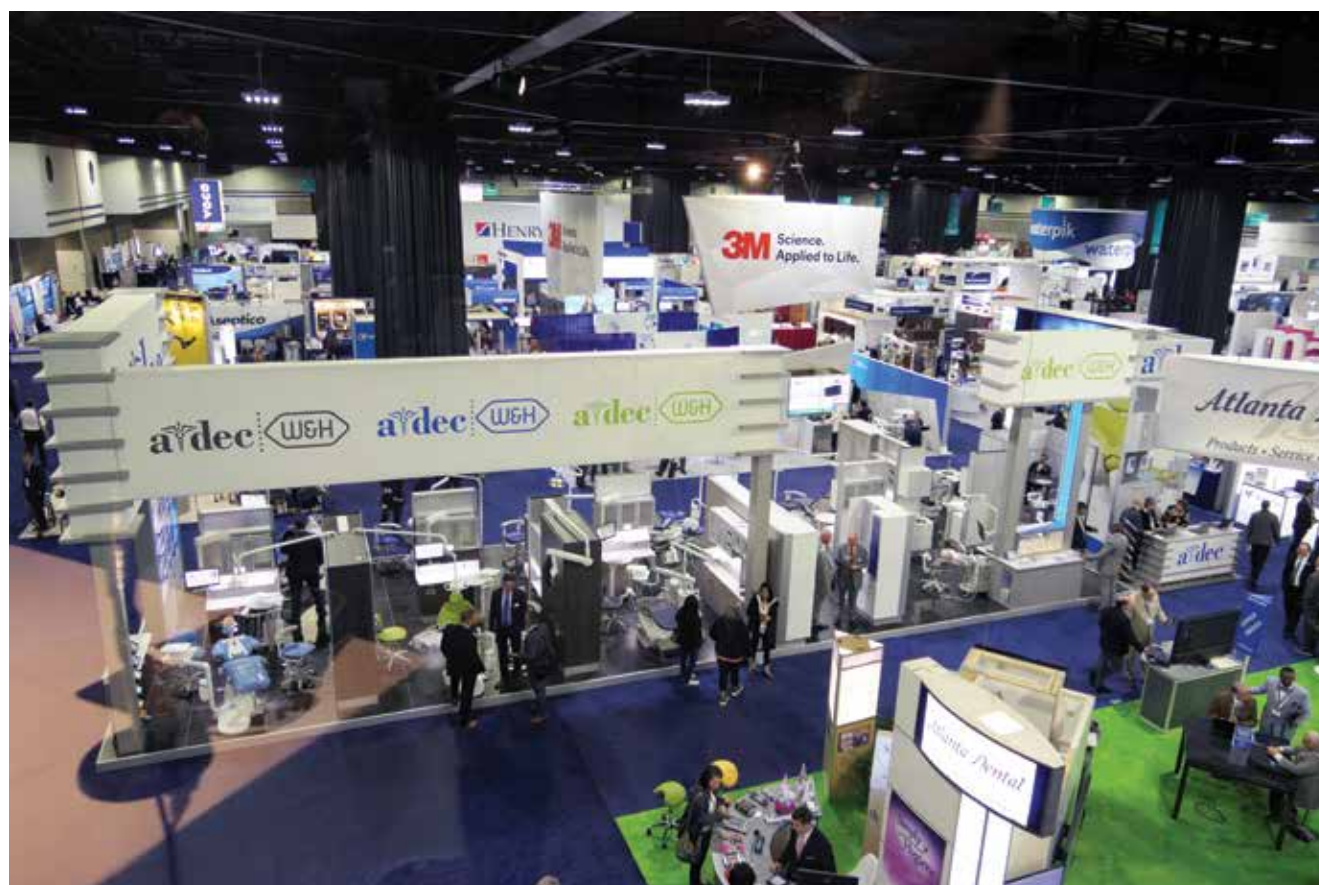
Attendees wander the exhibit hall just minutes after the doors open Thursday morning.

Opinions expressed by authors are their own and may not reflect those of Tribune America or Dental Tribune International.