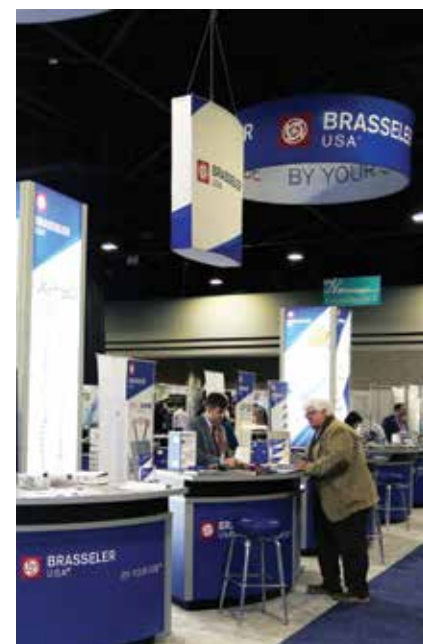
• If it's handpieces or instruments that you're in the market for, you'll want to head straight to the Brasseler booth at No. 937.