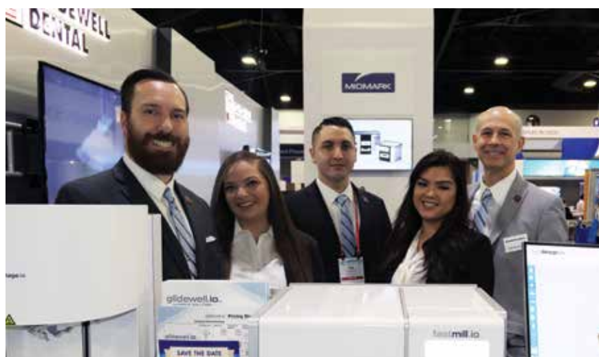
• Want to learn about Glidewell Dental's new glidewell.io in-office solution? Everyone at booth No. 929 is happy to fill you in.