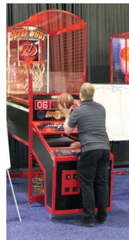
• Are your basketball skills up to par? Stop by the Hinman Hoops area, located just behind Aisle 300 in the exhibit hall, between 11:30 a.m. and 1 p.m. and between 4 and 5:30 p.m. today for your chance to win some cash. The attendees who can score the most baskets during each of the two time frames will win a $100 gift card. Second place gets $50 while third heads home with $20. The event is sponsored by Atlanta Dental.