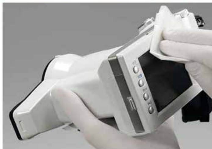
■ The new and improved EyeSpecial C-3 digital dental camera helps dental practices and laboratories increase patient acceptance and productivity.

tions without requiring any retrofitted add-ons. Specifically, one of the more useful features of Shofu's camera is the ISOLATESHADEMODE, which instantly grays out the gingival tissue to improve visual perspicacity for accurate shade analysis and communication with a dental laboratory technician.