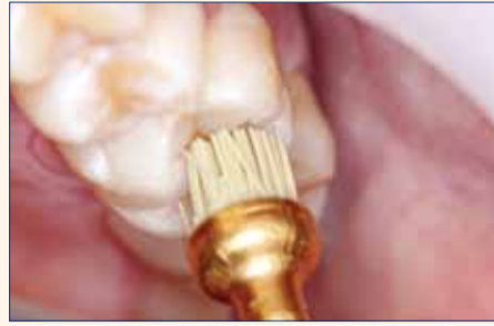
Fig. 11. Final polishing is performed with Astrobrush.