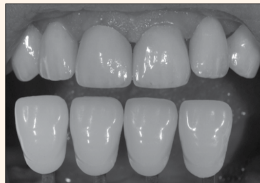
Fig 7. The low value of the first set of veneers compared to the bleach shade guide in a B&W photo