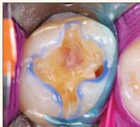
Fig. 5. Prior to the application of the adhesive, the cavity is etched with phosphoric acid.