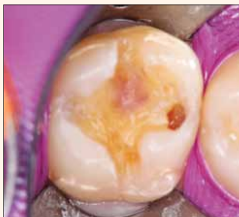
Fig. 4. After the rubber dam has been placed, the restoration as well as carious tissue are removed.