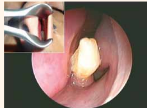
Anterior rhinoscopy (upper left) and endoscopic view of the supernumerary tooth in the patient's nasal cavity.

While supernumerary teeth are usually asymptomatic, patients may present with a variety of symptoms, including nasal obstruction, headache, nosebleed