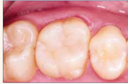
Figs 12 and 13. The result is an esthetic posterior restoration without postoperative sensitivity.