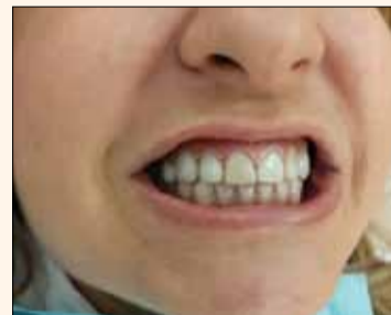
Fig 2. The pre-operative situation