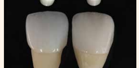
Fig 10. A comparison between the LT BL1 veneer and the MO0 veneer

in, it was ND4, noting that the one reported in the beginning was ND2. (Fig 4) It seems that those veneers lost luminosity after placing them on the prepped teeth, what indicated a bad influence on the final color. Nothing can be done at this moment to get those veneers back to life. A decision to repeat the case was simply taken, with no hesitation, photos of the tried-in