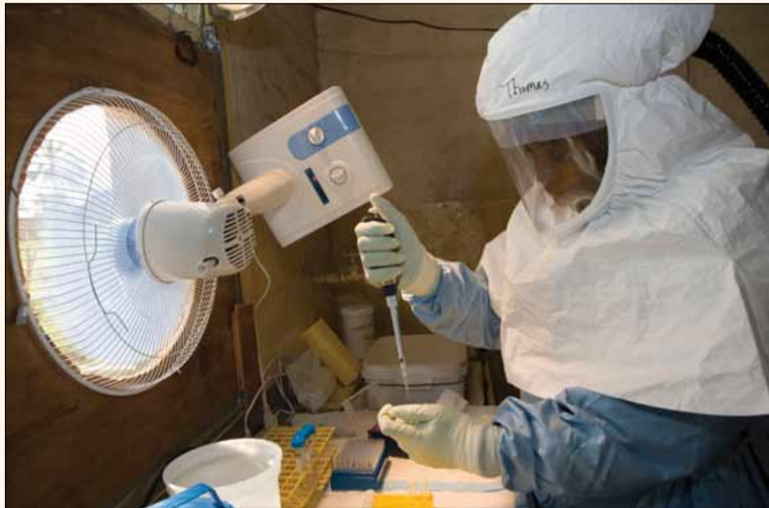
A laboratory worker in the Democratic Republic of Congo does a test using a micropipette. Quick on-site laboratory diagnosis enable the World Health Organization response team to precisely diagnose new suspected Ebola patients within two to six hours.

In dentistry, we are constantly exposed to these emerging and re-emerging infectious threats and we cannot afford to let our guard down. Vigilance, awareness and good clinical practice with standard infection control at all times are fundamental to prevention, as yet-unimagined new diseases surely lie in wait. Although we have made spectacular technical and scientific advances since the release of the original IOM report some two decades ago, it appears that humans are still defenceless in the face of the relentless march of our microbe foes. drug-resistant tuberculosis. D1