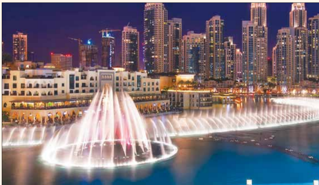
Fig. 1: Dubai's skyline and the spectacular Dubai Fountain – highlights of the visit to the largest city in the United Arab Emirates.