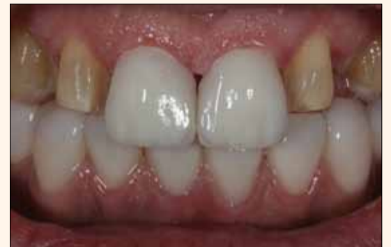
Fig 6. The non-vital appearance of the first set of veneers centrals on the day of Try-in