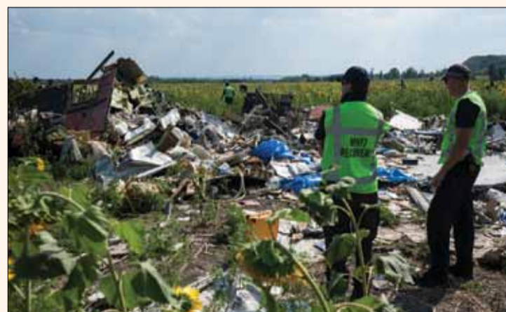
International investigators survey the MH17 crash site, 5 August 2014.