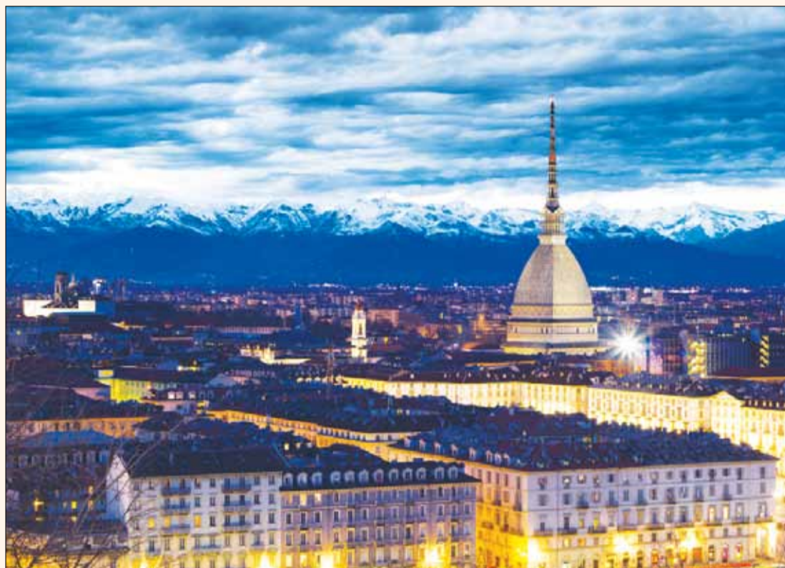
Turin with Mole Antonelliana and the Alps in the background.