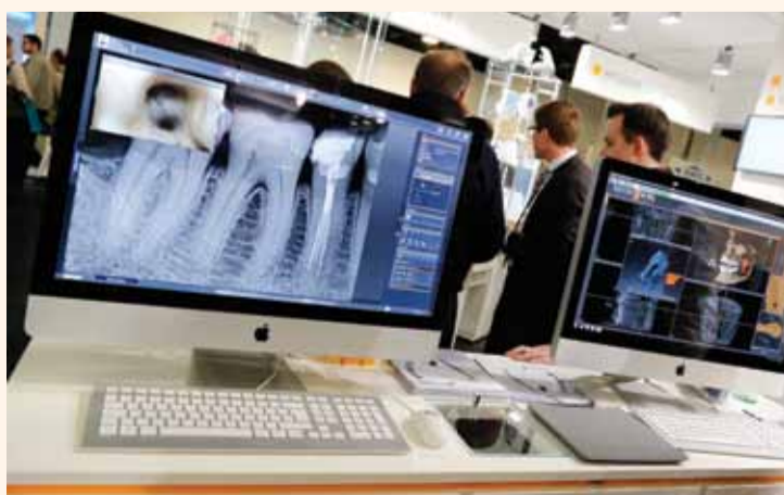
Many manufacturers will be exhibiting their latest innovations in digital dental technology at IDS 2015.

The 36th IDS will take place from 10 to 14 March 2015 in Cologne. According to the latest figures provided by IDS organiser Koelnmesse, 1,400 exhibitors from 46 countries have already confirmed their participation. DTI