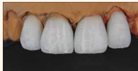
Fig 9. The texturized veneers on the control (non-segmented) model