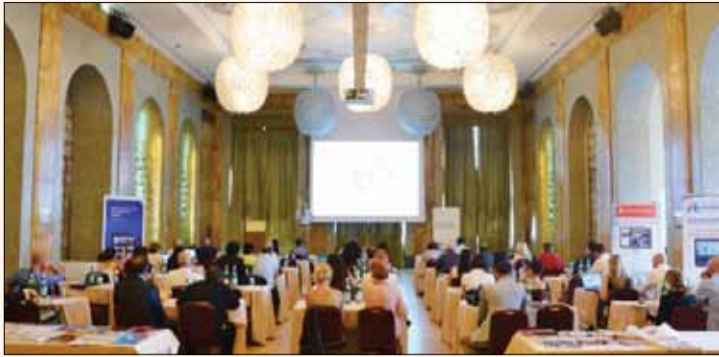
DTI held its tenth publishers' meeting in Turin.

educational portfolio over the past decade. He pointed out that the company's educational offerings in particular have become an essential part of DTI's product portfolio. Besides its flagship