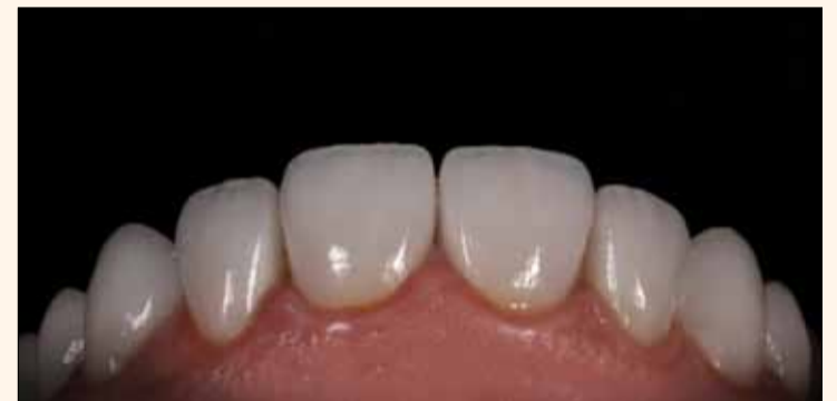
Fig 17. The front set of veneers with a black background contrastor