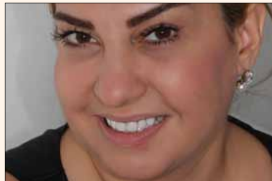
Fig 5. The patient checking her smile with the first set of veneers

A comparison with the failed previous set; in order to make sure that I succeeded boosting the luminosity level was important after transferring the dentin background of the natural prep from the patient mouth to my