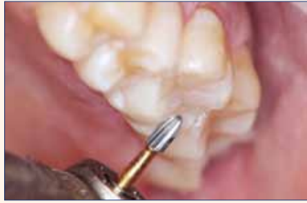
Fig. 10. Carbide burs are recommended for the removal of marginal overhangs.