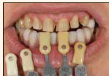
Fig 4. The degree of discoloration of the prepped dentin according to the ND shade guide

of view on the shade after taking few minutes to absorb the tried-in set. They all agreed that something still missing for the case to be esthetically pleasing, as if all the light rays coming from inside the veneers faded down after being placed on the prepped teeth (dentist stated in privacy). Soon we realized that the discoloration of the prepped dentin continued on darkening during the 10 days lab work process. So at the day of the try-