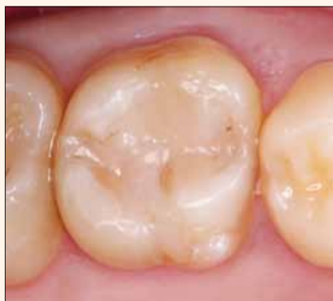
Fig. 3. Preoperative situation: The restoration of the upper posterior tooth shows a marginal fracture.

Bulk-fill composites should offer high depth of cure. This is