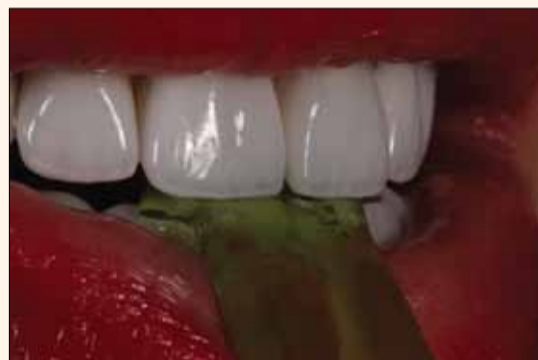
Fig 15. Bright mammons strips overlapping with translucent opal strips, all framed with halo effect