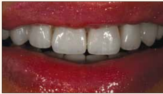
Fig 11a.11b. The glamor smile right after cementing the second set of veneers, and using the polishing rubber heads (Optrafine, Ivoclarvivadent)

What we simply did was changing not just the patient smile literally, but changing the smile on her face emotionally, the feel-