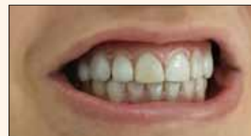
Fig 3. The pre-op situation reflecting the non-vital appearance of the old veneers and the surrounding gingiva