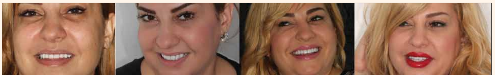
Fig 14. The change on our patient face from the time she showed up to the clinic, till one year recall visit