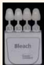
Fig 1. Bleach shade guide, (Ivoclarvivadent A-D shade guide)

On the day of the try-in, patient showed up to the clinic, she was excited to see the new smile. When she looked at the mirror she felt the change. (Fig 5) All the measurements of esthetic smile, from teeth arrangement to lips dynamic appeared perfect on her face. The dental team members had different point