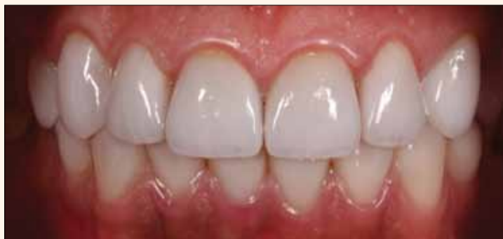
Fig 12. One month recall, Close-up front picture, showing the improvement in the interdental papilla and the relative translucency level with the lower set