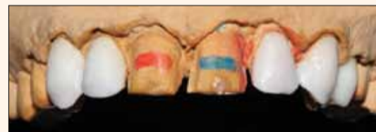
Fig 8a, 8b. Masking test of the MO0 ingot shells