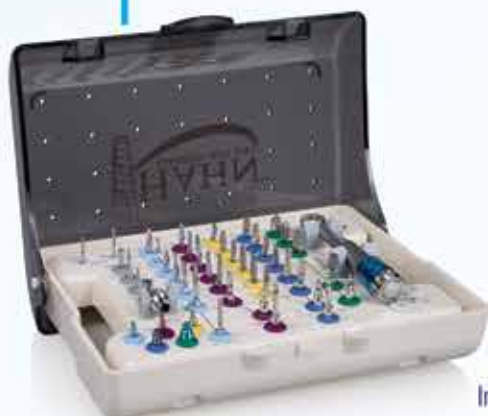
Hahn™ Tapered Implant Surgical Kit