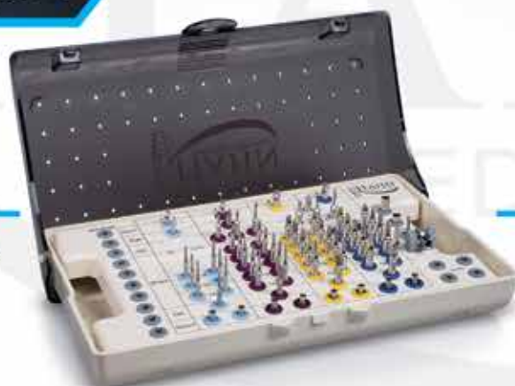
Hahn™ Tapered Implant Guided Surgical Kit

Purchase 25 implants for $4,000 and receive