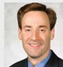
Michael Ignelzi Pediatric Dentistry