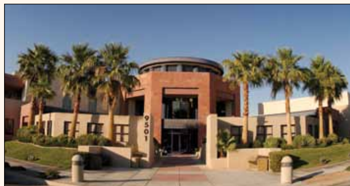
Las Vegas Institute for Advanced Dental Studies offers Core I, a three-day course for doctors and their teams.

That's why when you call, we will answer the phone, "LVI, where lives are changing daily!"