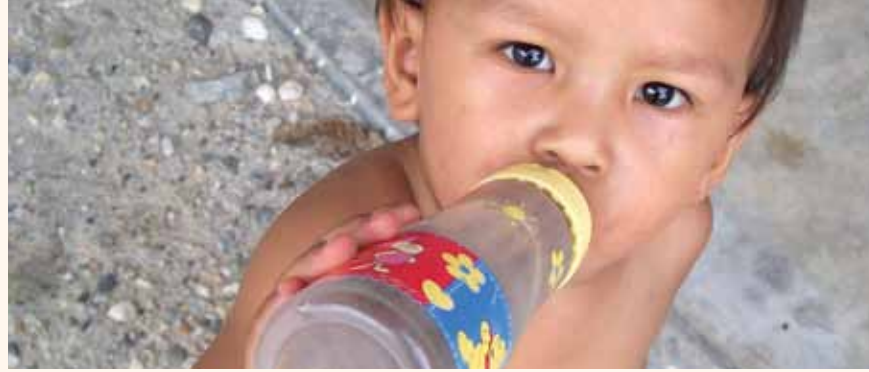
One of the risk factors for early childhood caries, also known as baby bottle tooth decay, is frequent and prolonged exposure of a baby's teeth to high sugar content liquids such as fruit juice, milk or formula.

However, the investigators cautioned that this report represents only the tip of the iceberg because only day procedures at hospitals were included. Children who had undergone surgery in dentists'