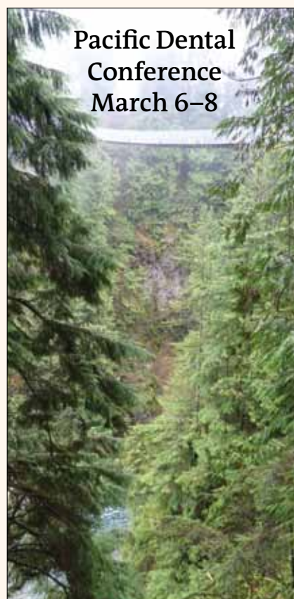
The 137-metre-long and 70-metre-high Capilano Suspension Bridge — and surrounding coastal rainforest park featuring smaller suspension bridges linking old-growth trees — is a seabus and city bus ride away from the Vancouver Convention Centre, host site of the Pacific Dental Conference.