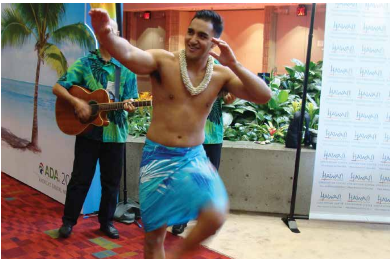
• To greet dentists and visitors to Honolulu to ADA 2018 – America's Dental Meeting, the ADA will host 'Some Enchanted Evening: A Welcome Celebration' at the Waikiki Shell today from 5:30 to 9 p.m., billed as a musical celebration of the many cultures that call Hawaii home.