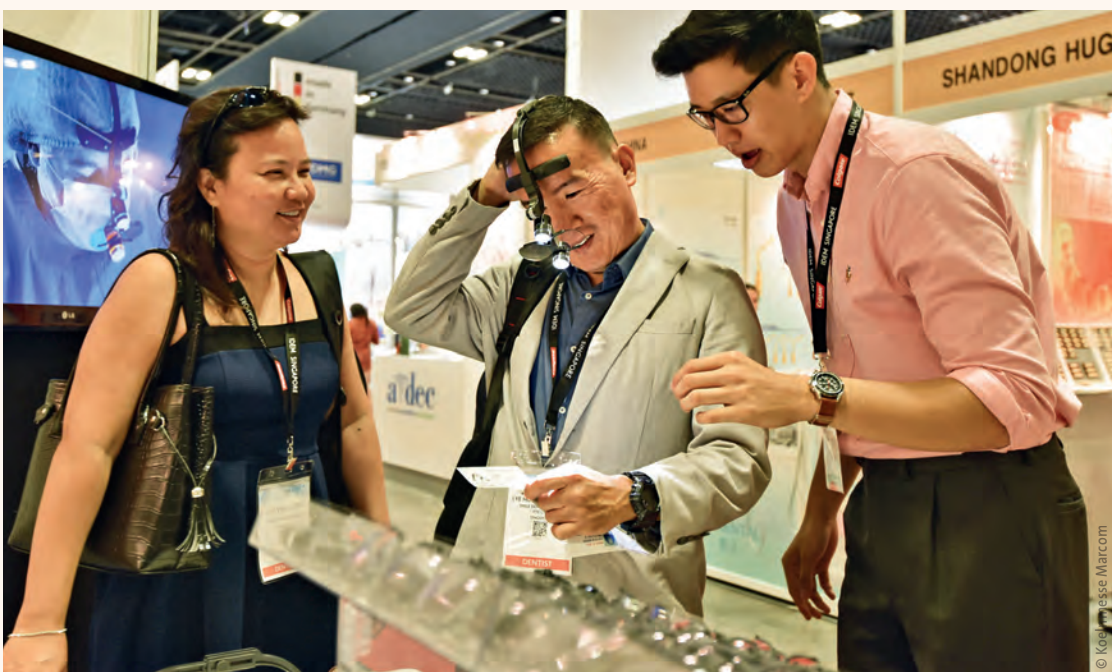
Hosted at the Suntec Singapore Convention and Exhibition Centre, IDEM 2018 will be held under the theme "Striving for clinical excellence".

Online registration for IDEM 2018 is now open at www.idem-singapore.com .