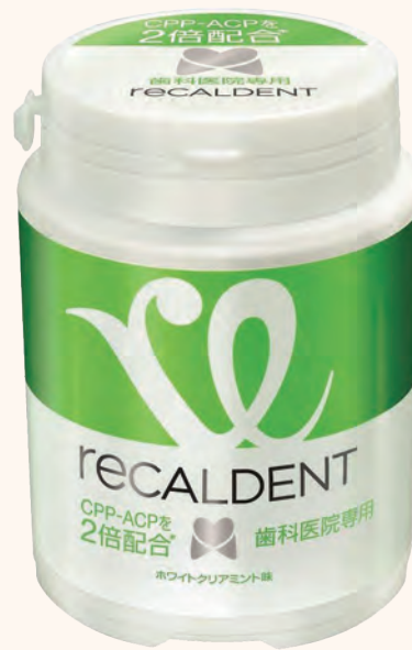
Big in Japan: RECALDENT gum is the largest selling sugar-free gum in the Asian country. Furthermore, Japanese dental company GC has incorporated RECALDENT into a wide range of products.