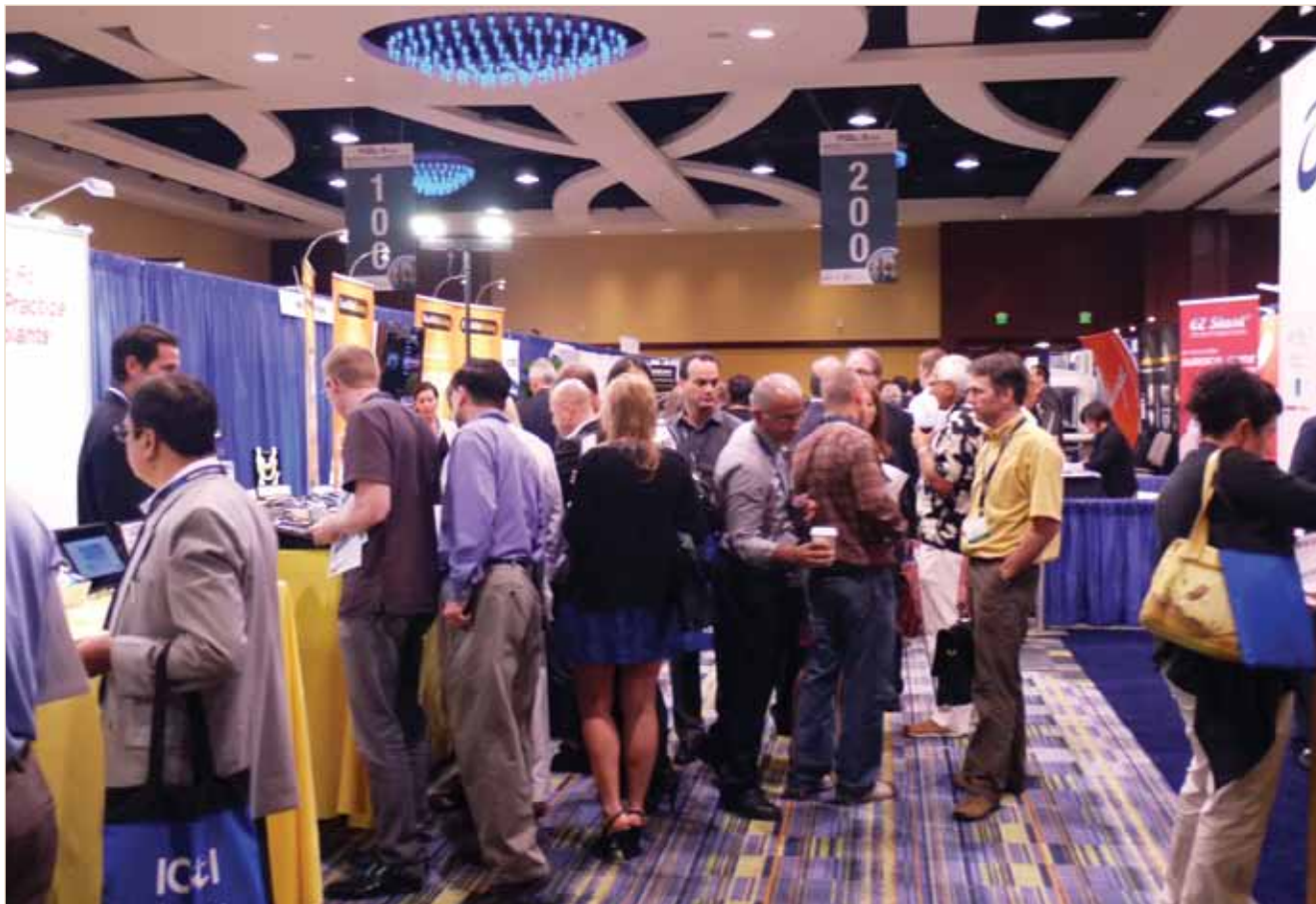
Participants flow through the exhibit hall at the ICOI World Congress in Florida this September.

ICOI celebrates milestone with a look at implant dentistry's innovations, complications and controversies