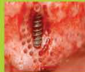
After cortex perforation, buccal implant concavity is filled with OsteoGen® to slightly above level of cortex. OsteoTape® is secured over the graft with 1.5 mm Self-Drilling screws.