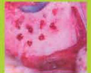
Ridge height and width modeling requires 1.5 mm to 2.0 mm cortical perforations to maintain vascularity over a longer period of time. On x-rays at 4 to 5 months, defect site will show radiopaque.