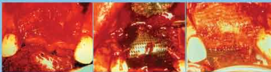
Debridement and evacuation of buccal region was followed by perforating the cortex to marrow using 2 mm round bur. Bleeding was controlled, and the defect concavities were grafted with OsteoGen®.