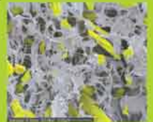
SIMULATES NATURAL COLLAGEN MATRIX AND MINERAL STRUCTURE OF HUMAN BONE

Make 2 mm holes and use medullary blood to build better bone