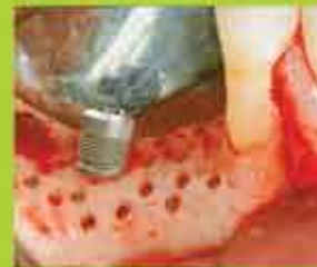
Holes are made through the cortex. Defect concavities are grafted with OsteoGen®. Modeling is attained by securing OsteoTape® strips dry over graft with 1.5 mm Self-Drilling screws.

SURGICAL TECHNIQUE TO ACHIEVE REGIONAL ACCELERATORY PHENOMENON