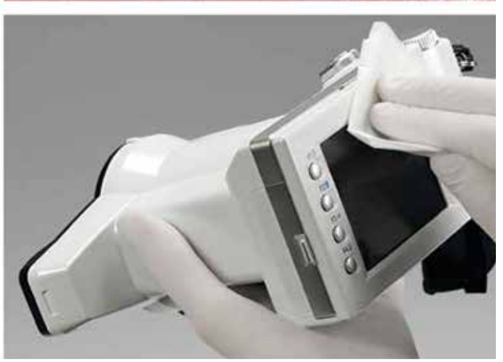
The new and improved EyeSpecial C-III digital dental camera helps dental practices and laboratories increase patient acceptance and productivity.

tions without requiring any retrofitted add-ons. Specifically, one of the more useful features of Shofu's camera is the ISOLATE SHADE MODE, which instantly grays out the gingival tissue to improve visual perspicacity for accurate shade analysis and communication with a dental laboratory technician.