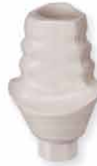
Custom impression coping included