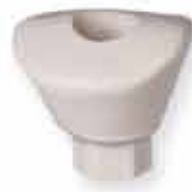
Custom healing abutment included